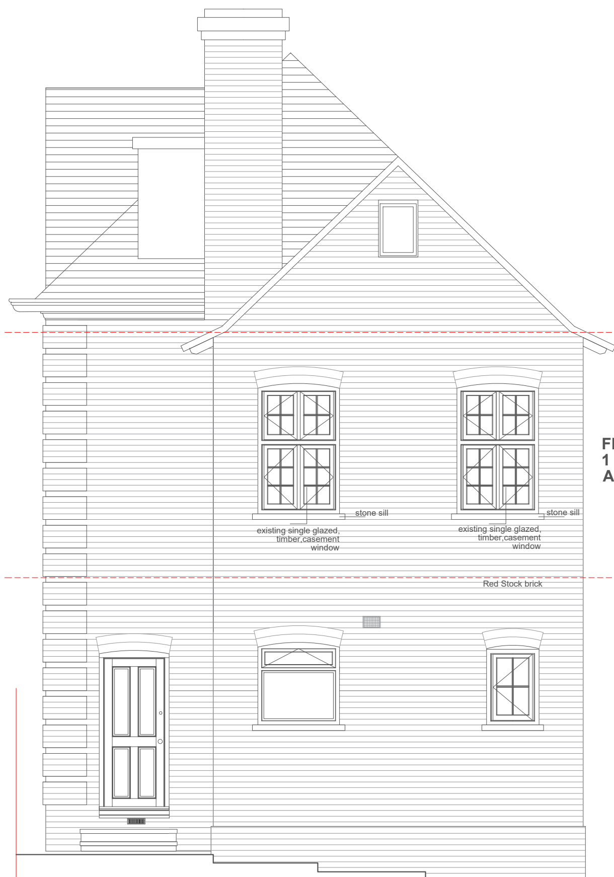
Flat 3 1 Rosecroft Avenue