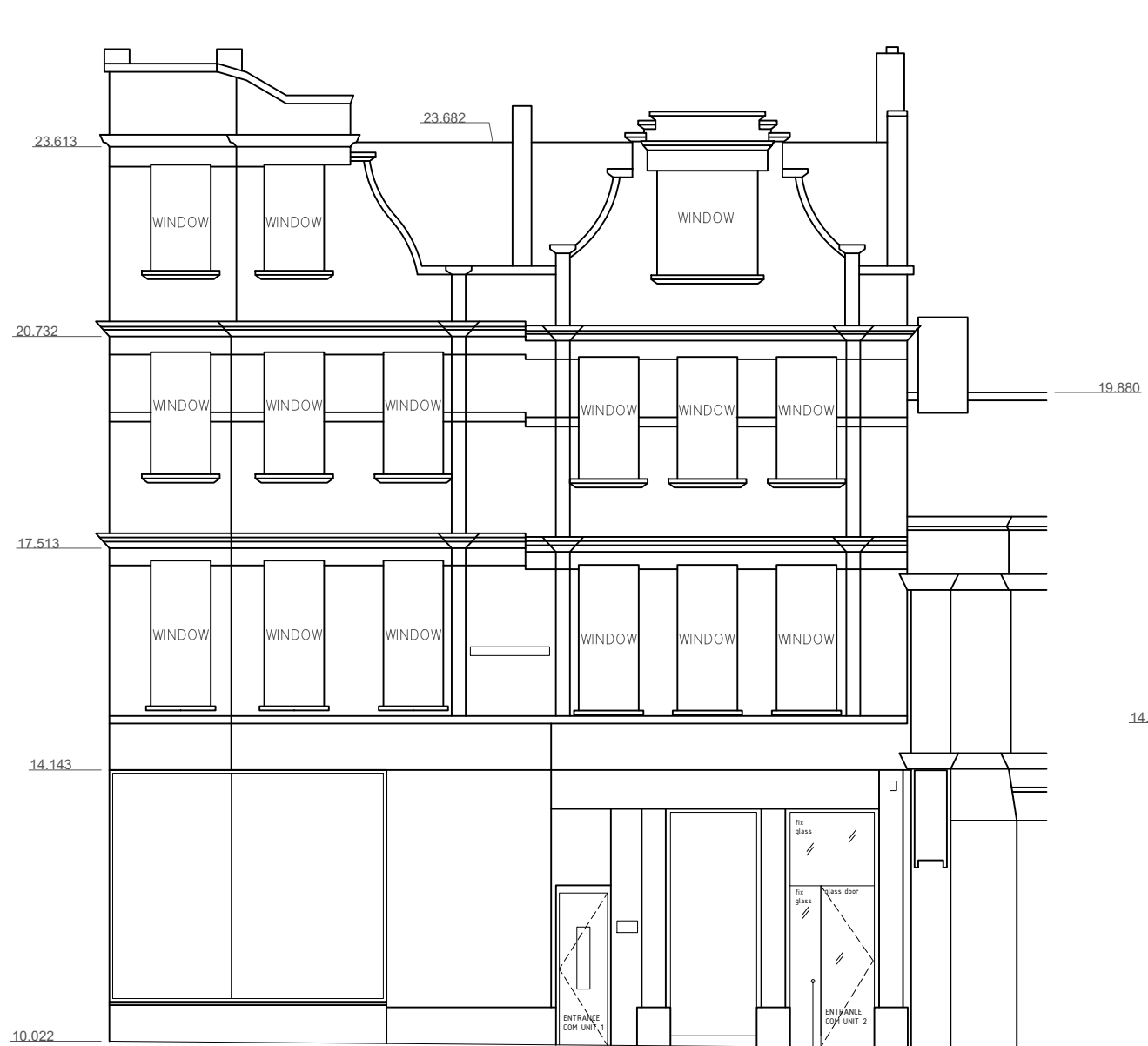
FINCHLEY ROAD ELEVATION - PROPOSED