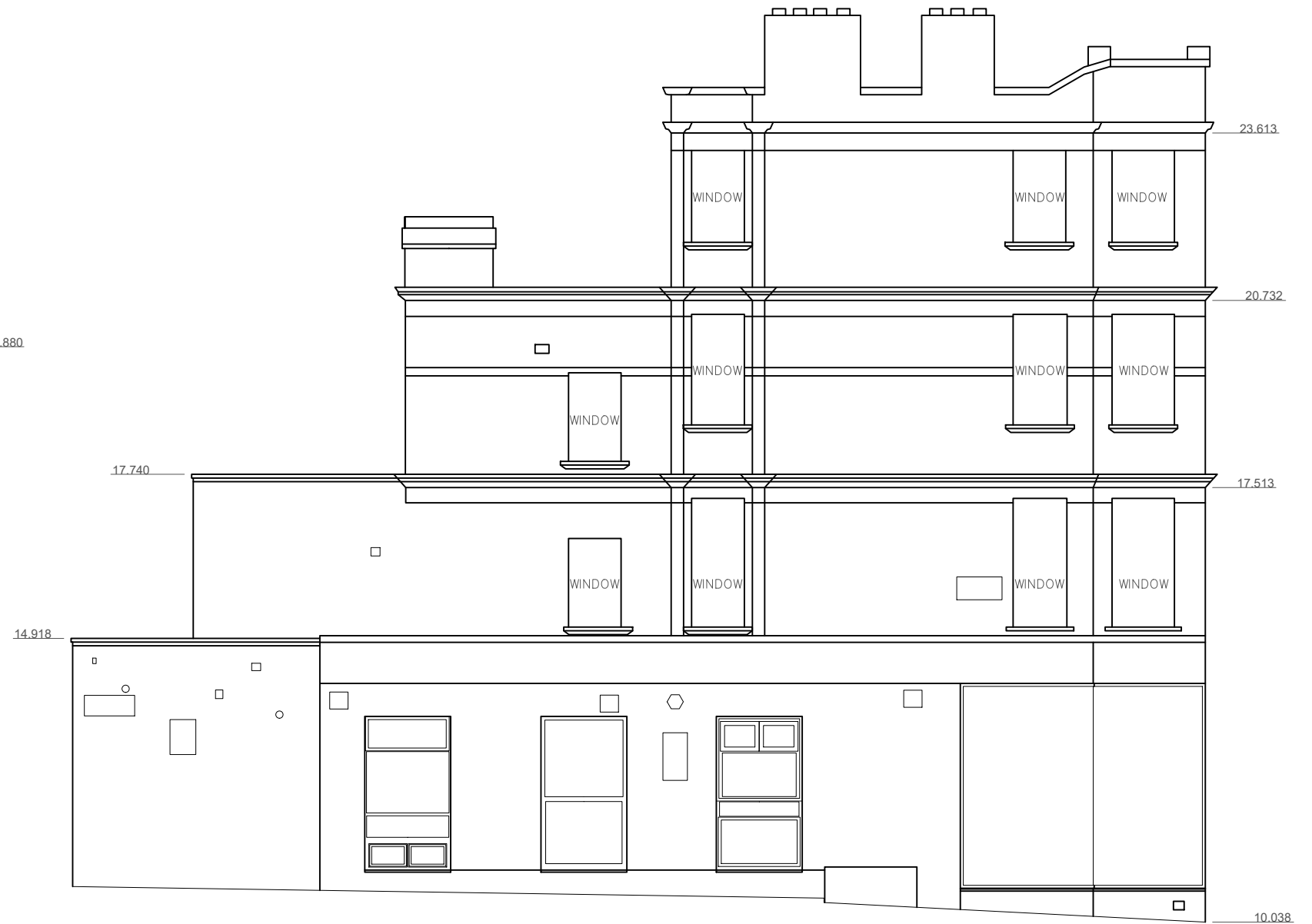
FROGNAL ELEVATION - PROPOSED (NO CHANGES PROPOSED FOR THIS ELEVATION)

DOCUMENT NOTES: 1. THIS DRAWING IS FOR PLANNING PURPOSES ONLY AND SHOULD NOT BE USED FOR CONSTRUCTION. 2. THIS DRAWING AND DESIGN IS FOR USE SOLELY IN CONNECTION WITH THE PROJECT DESCRIBED BELOW. 3. THIS DRAWING AND DESIGN IS THE PROPERTY OF AS STUDIO AND MUST NOT BE ISSUED, LOANED OR COPIED WITHOUT WRITTEN CONSENT. 4. THIS DRAWING IS TO BE READ IN CONJUNCTION WITH ALL ADDITIONAL INFORMATION FORMING PART OF THIS APPLICATION.