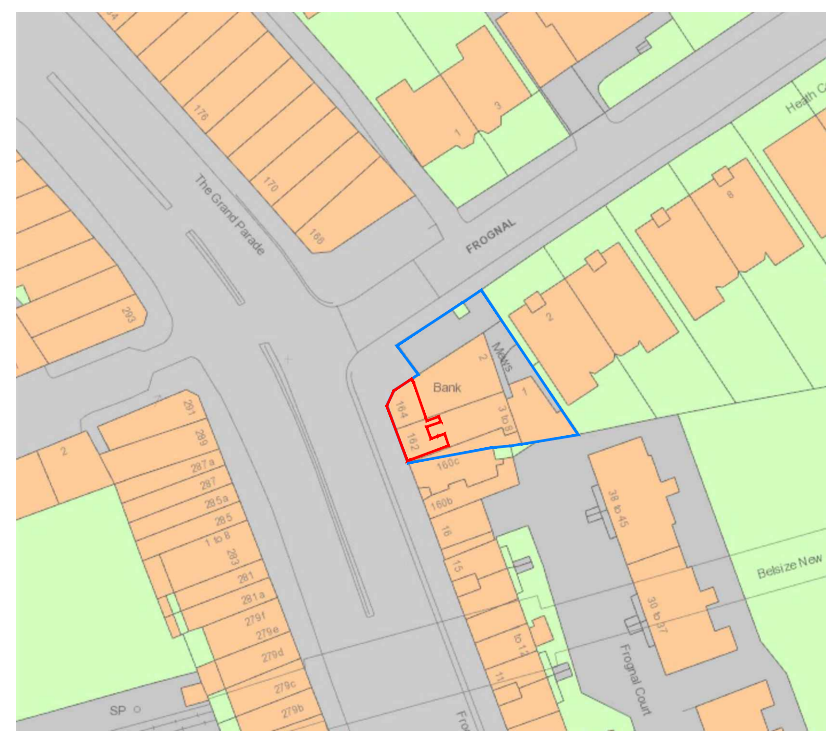
LOCATION PLAN 0 10 20 50M

DOCUMENT NOTES: 1. THIS DRAWING IS FOR PLANNING PURPOSES ONLY AND SHOULD NOT BE USED FOR CONSTRUCTION. 2. THIS DRAWING AND DESIGN IS FOR USE SOLELY IN CONNECTION WITH THE PROJECT DESCRIBED BELOW. 3. THIS DRAWING AND DESIGN IS THE PROPERTY OF AS STUDIO AND MUST NOT BE ISSUED, LOANED OR COPIED WITHOUT WRITTEN CONSENT. 4. THIS DRAWING IS TO BE READ IN CONJUNCTION WITH ALL ADDITIONAL INFORMATION FORMING PART OF THIS APPLICATION.