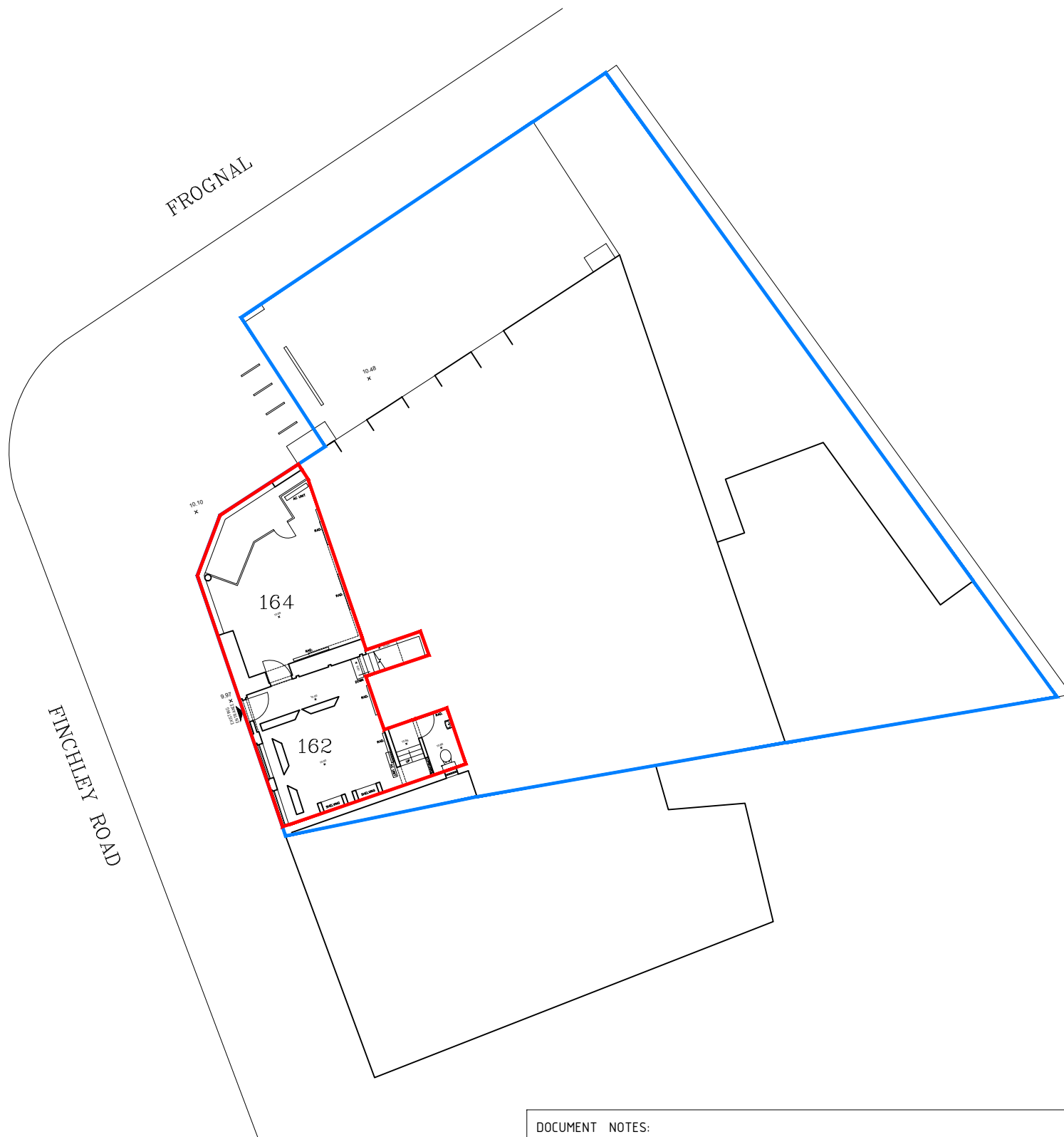
SITE PLAN 0m 1m 2m 5m 10m

DOCUMENT NOTES: 1. THIS DRAWING IS FOR PLANNING PURPOSES ONLY AND SHOULD NOT BE USED FOR CONSTRUCTION. 2. THIS DRAWING AND DESIGN IS FOR USE SOLELY IN CONNECTION WITH THE PROJECT DESCRIBED BELOW. 3. THIS DRAWING AND DESIGN IS THE PROPERTY OF AS STUDIO AND MUST NOT BE ISSUED, LOANED OR COPIED WITHOUT WRITTEN CONSENT. 4. THIS DRAWING IS TO BE READ IN CONJUNCTION WITH ALL ADDITIONAL INFORMATION FORMING PART OF THIS APPLICATION.