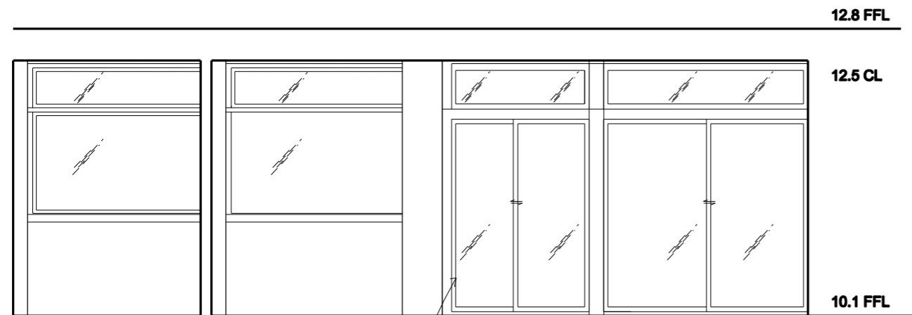
Flat 9 - Section DD Original

Original metal sliding balcony doors replaced with new UPVC sliding doors within existing opening. Existing high level window maintained. Existing sliding balcony doors and high level window