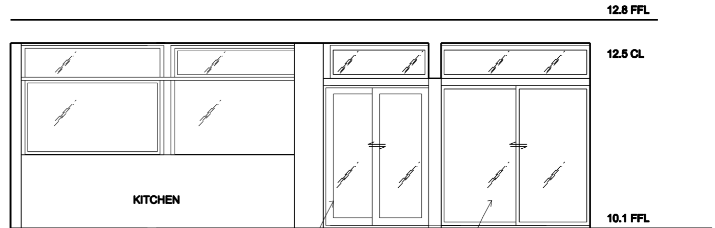
Flat 9 - Section DD Existing

Original metal sliding balcony doors replaced with new UPVC sliding doors within existing opening. Existing high level window maintained. Existing sliding balcony doors and high level window