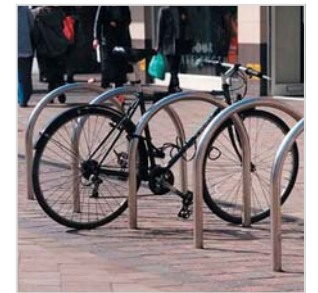
Broxap BXMW/GHO Harrogate Cycle Stand Stainless steel

THIS DRAWING IS COPYRIGHT PROTECTED AND ITS USE OR REPRODUCTION IN ANY WAY WITHOUT WRITTEN APPROVAL OF UNDERCURRENT LIMITED IS PROHIBITED. NO DIMENSIONS SHOULD BE SCALED FROM THE DRAWING AND ANY DISCREPANCIES FOUND IN THE DRAWING SHOULD BE REFERRED TO UNDERCURRENT LIMITED.