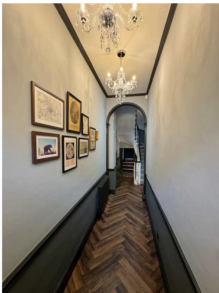
Entrance hallway at no.5