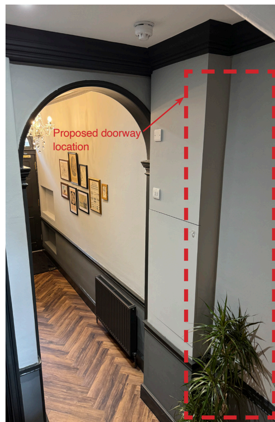
Entrance hallway at no.5