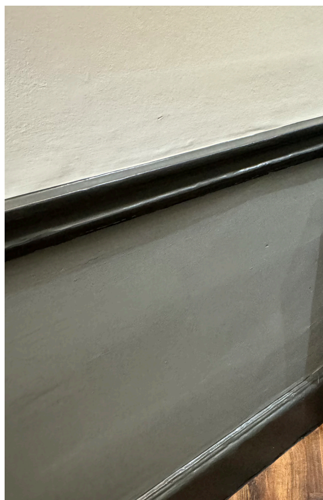
Existing skirting and dado rail (no.5)