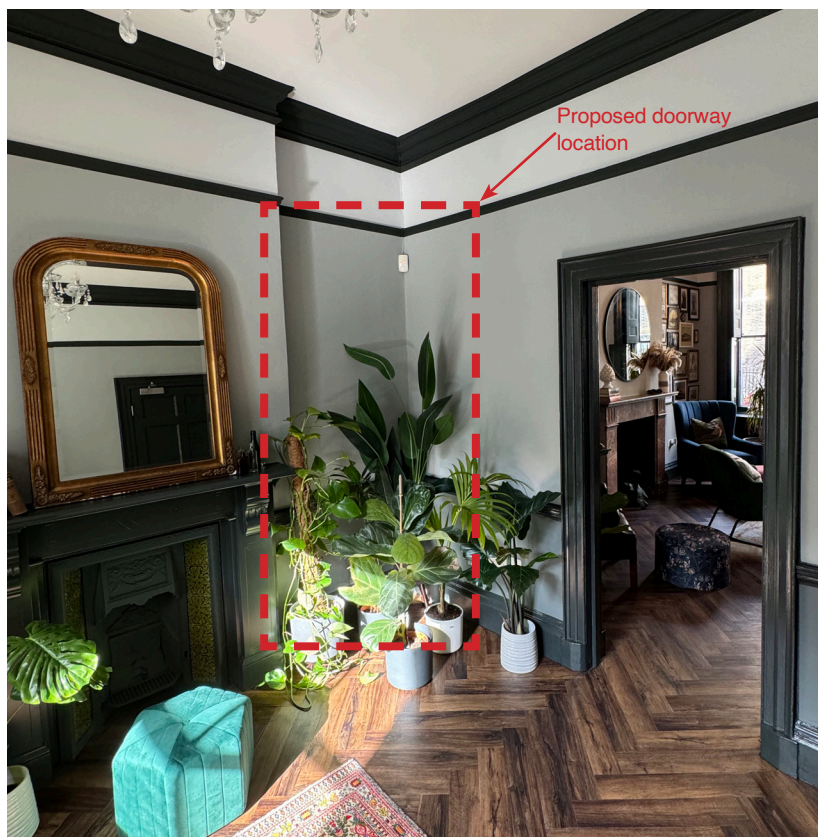
Lounge at no.3