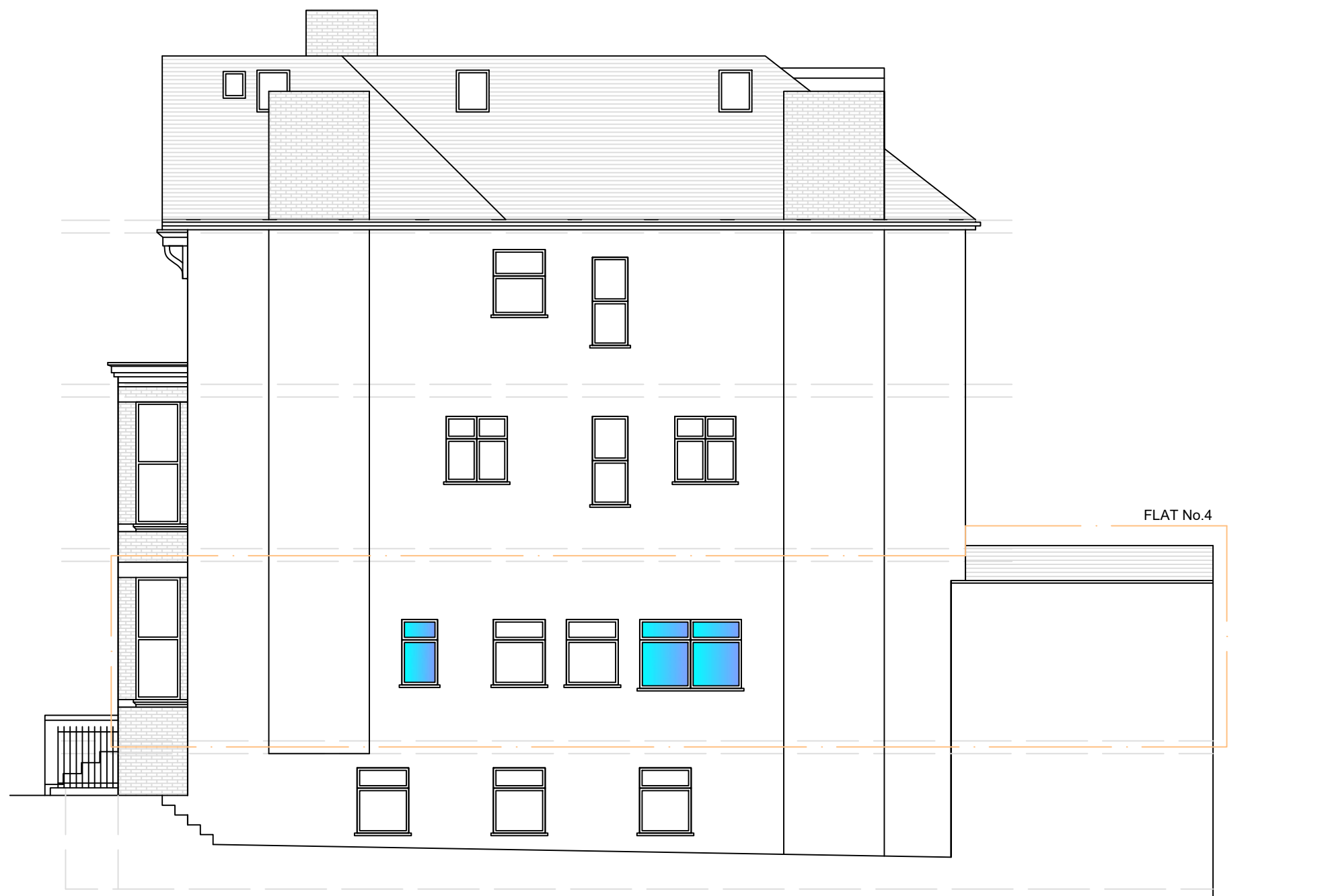
PROPOSED RIGHT SIDE ELEVATION