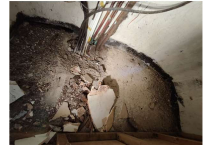
CABLES AND PIPES ENTERING THE BUILDING