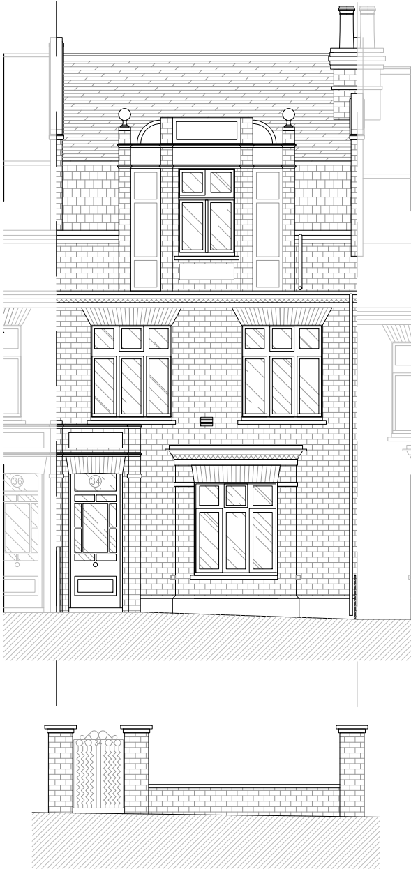
FRONT FACADE - EXISTING