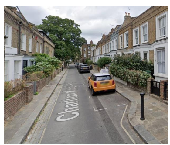
Figure 2: Parking

There is parking on one side of Charlton King's Road, however this would require the use of a residents parking permit.