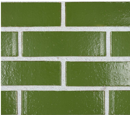
Glazed brick; EH Smith Valley Green

Aluminium windows are proposed to the smaller part of the extension. A pair of timber double doors allow direct access into the courtyard and a large rooflight over the main part of the extension provides natural light to the rear part of the kitchen / dining area.