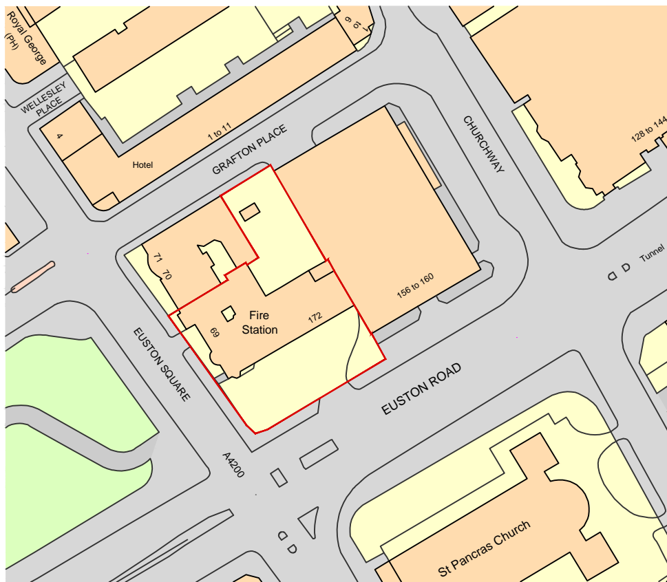
Site Location Scale 1:1250