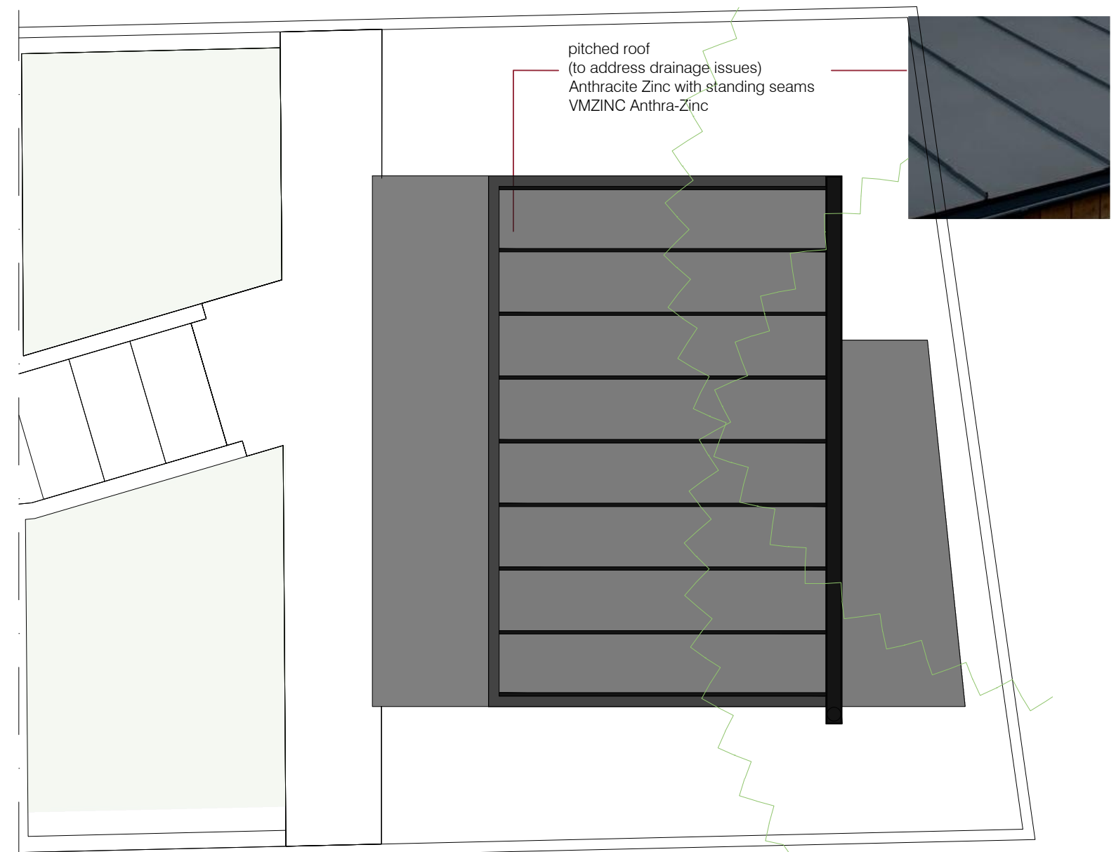
OUTBUILDING - PROPOSED ROOF PLAN

notes Do not scale this drawing. Drawing to be read in conjunction with relevant structural, mechanical, electrical and furniture drawings. All dimensions to be verified on site prior to making shop drawings or executing the works. SPATIAL AGENT to be immediately advised of any discrepancy between this drawing and site conditions. All works to be in accordance with local authority's and landlord's requirements. This drawing is protected by Copyright. It may not be reproduced in any form or by any means for any purpose, without gaining prior written permission from SPATIAL AGENT