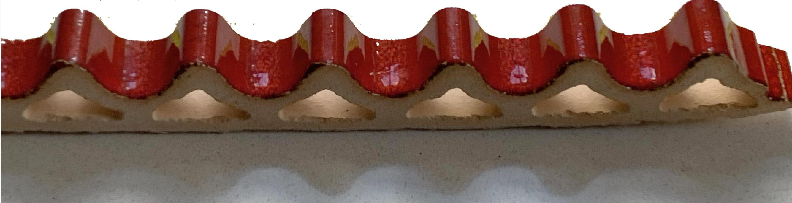
GLAZED CERAMIC CLADDING ( section sample 1:1 @ A3)

notes Do not scale this drawing. Drawing to be read in conjunction with relevant structural, mechanical, electrical and furniture drawings. All dimensions to be verified on site prior to making shop drawings or executing the works. SPATIAL AGENT to be immediately advised of any discrepancy between this drawing and site conditions. All works to be in accordance with local authority's and landlord's requirements. This drawing is protected by Copyright. It may not be reproduced in any form or by any means for any purpose, without gaining prior written permission from SPATIAL AGENT