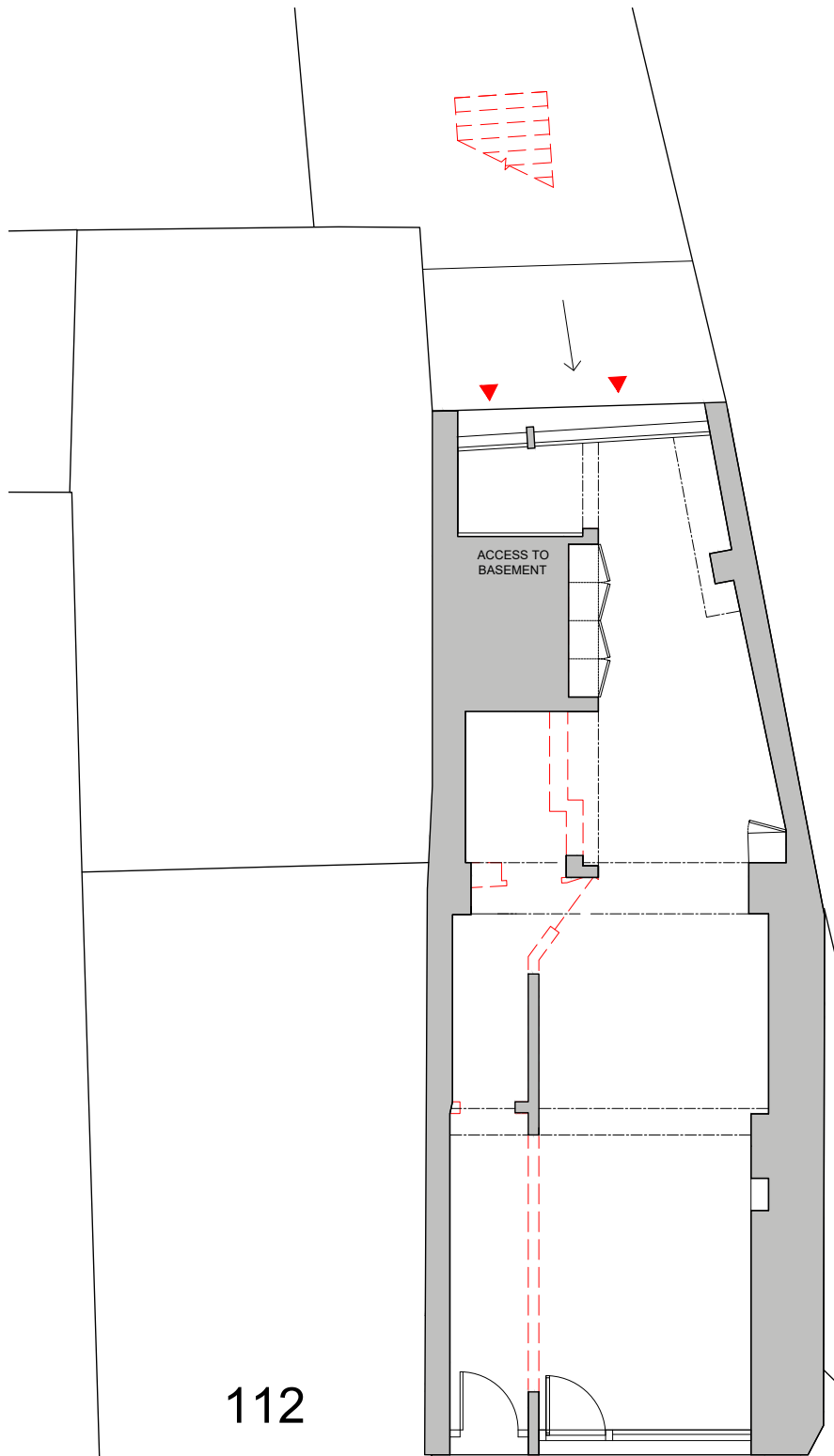
0 GROUND FLOOR DEMOLITION SCALE 1:50 @A1, 1:100 @A3