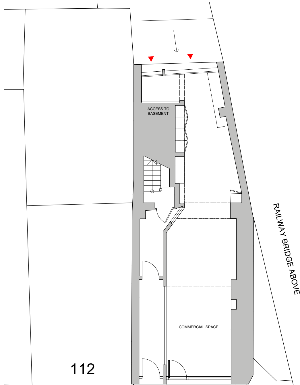
0 GROUND FLOOR PLAN EXISTING SCALE 1:50 @A1, 1:100 @A3

Copyright © Prime Building Consultants Limited. Do not reproduce without written permission.