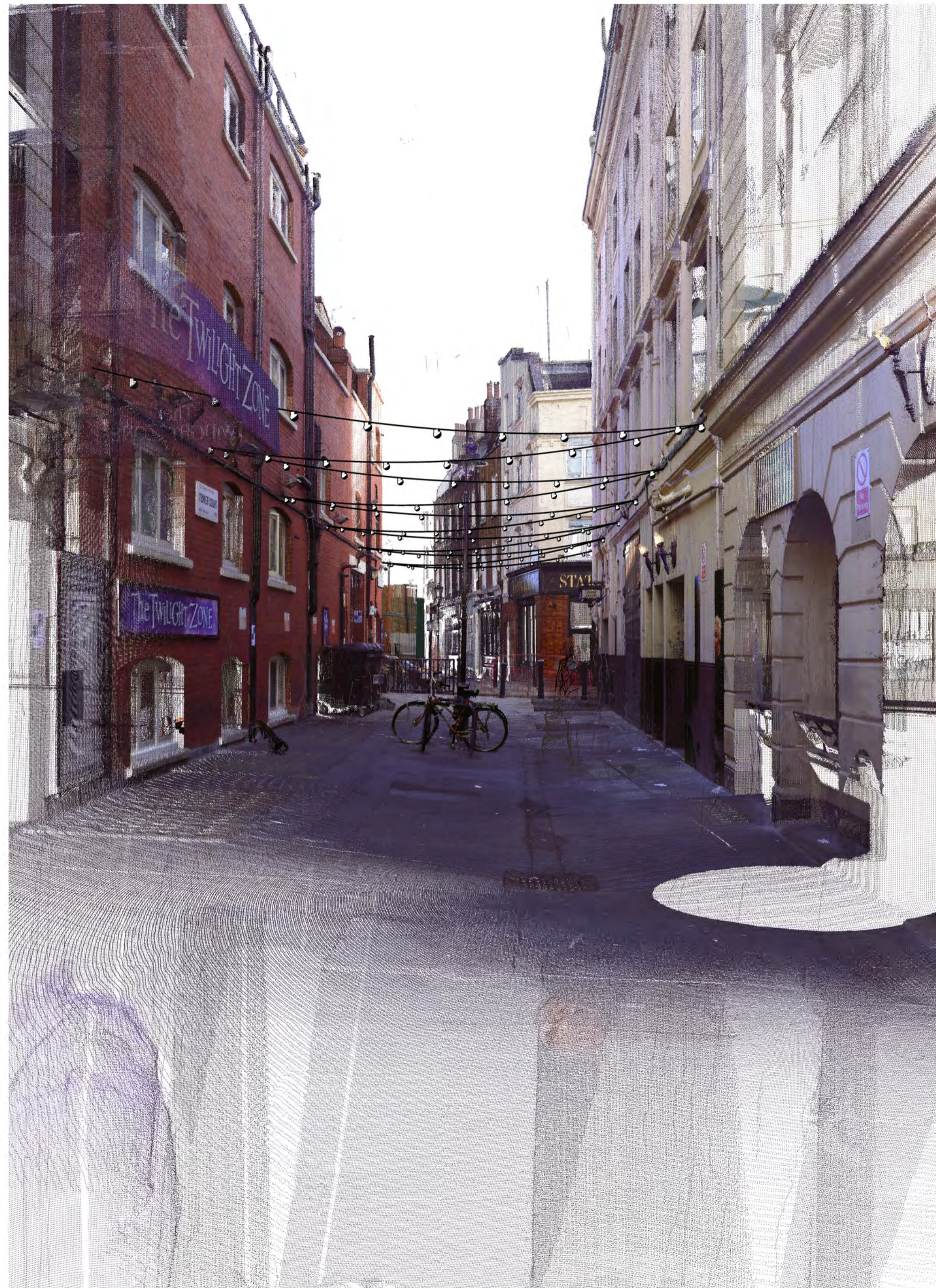
1 VIEW Tower Court View NTS

TO BE READ IN CONJUNCTION WITH DEMOLITION GA PLANS, SECTIONS, ELEVATIONS, FINISHES PLANS AND HERITAGE STATEMENT. REFER ALSO TO MEP ENGINEERS' STRIP OUT AND BUILDERSWORK INFORMATION AND LIGHTING LAYOUTS.