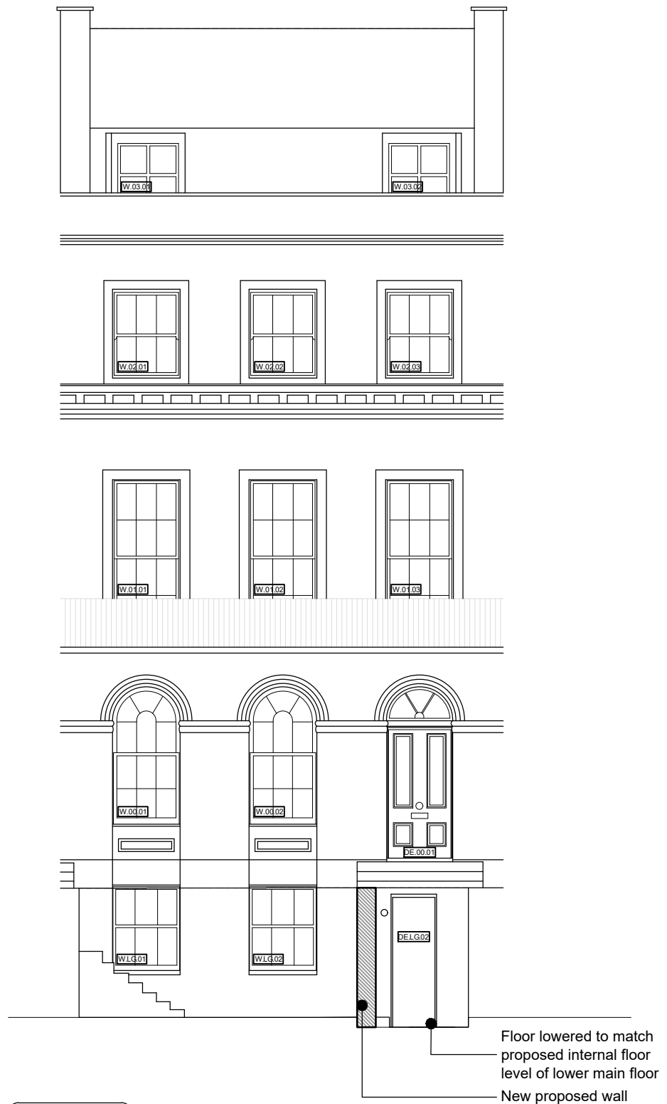
1 Proposed Front Elevation GHV 1:100 @ A3