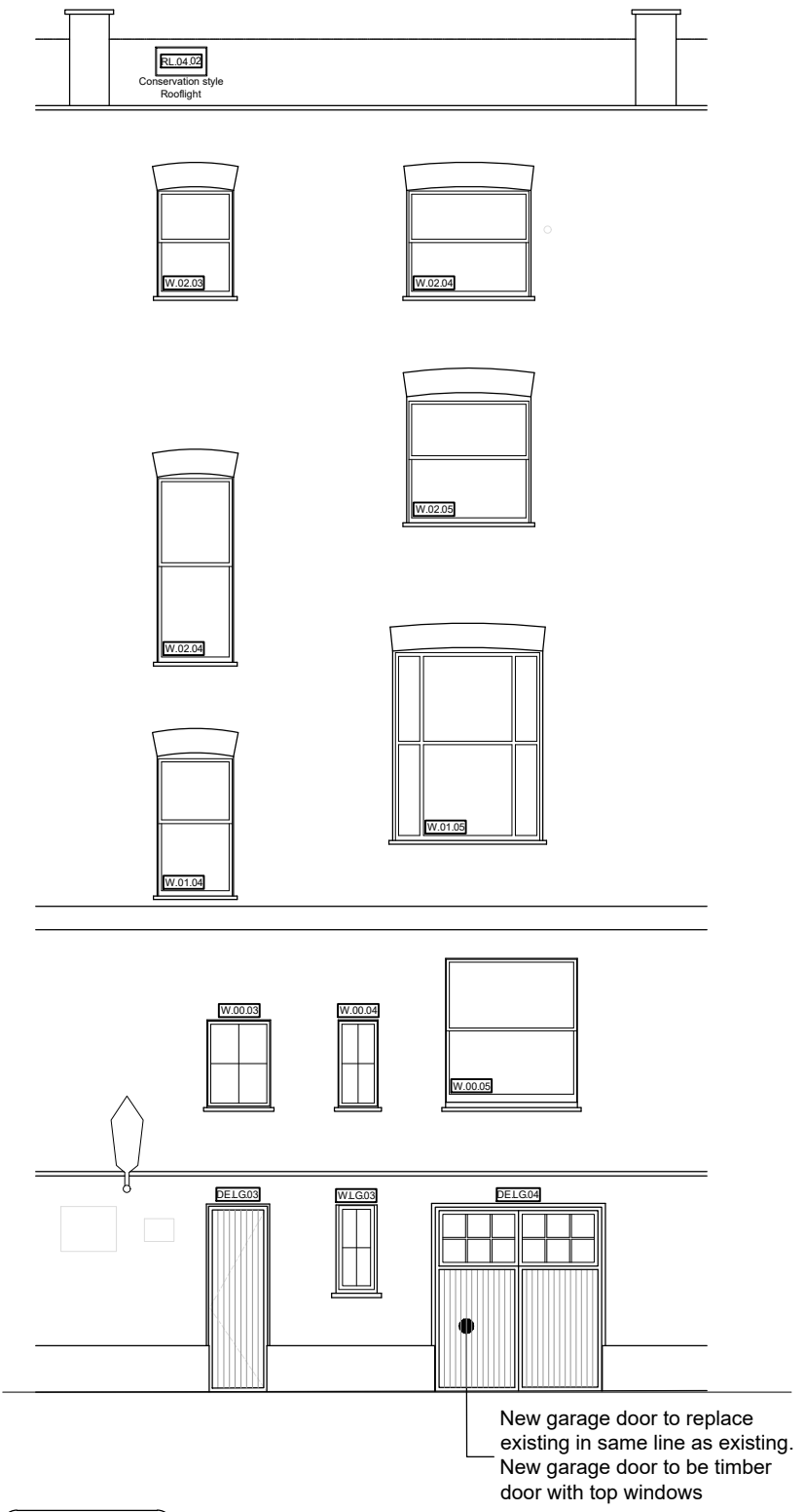
2 Proposed Rear Elevation GHV 1:100 @ A3