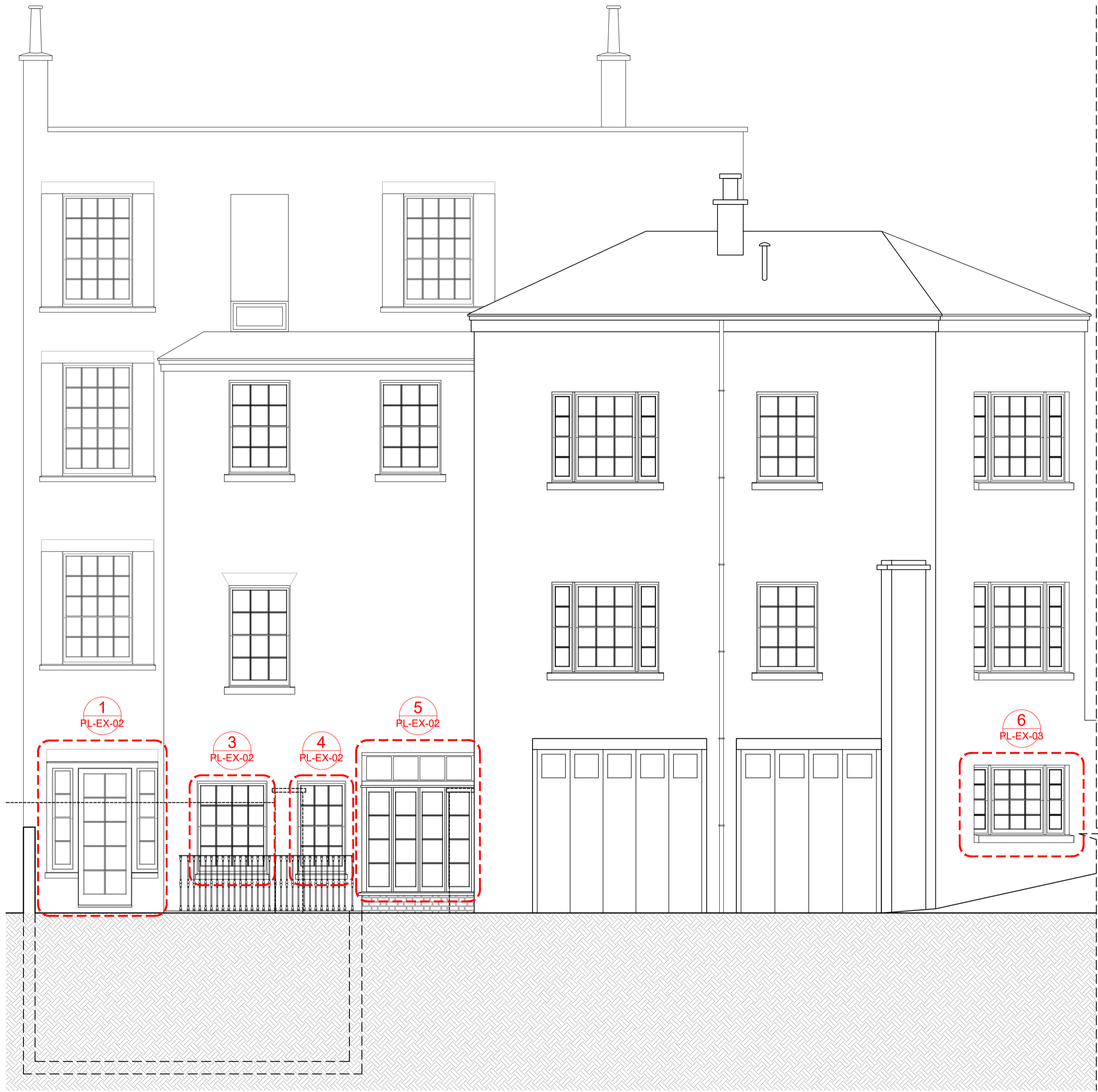
C | EXTERNAL ELEVATION