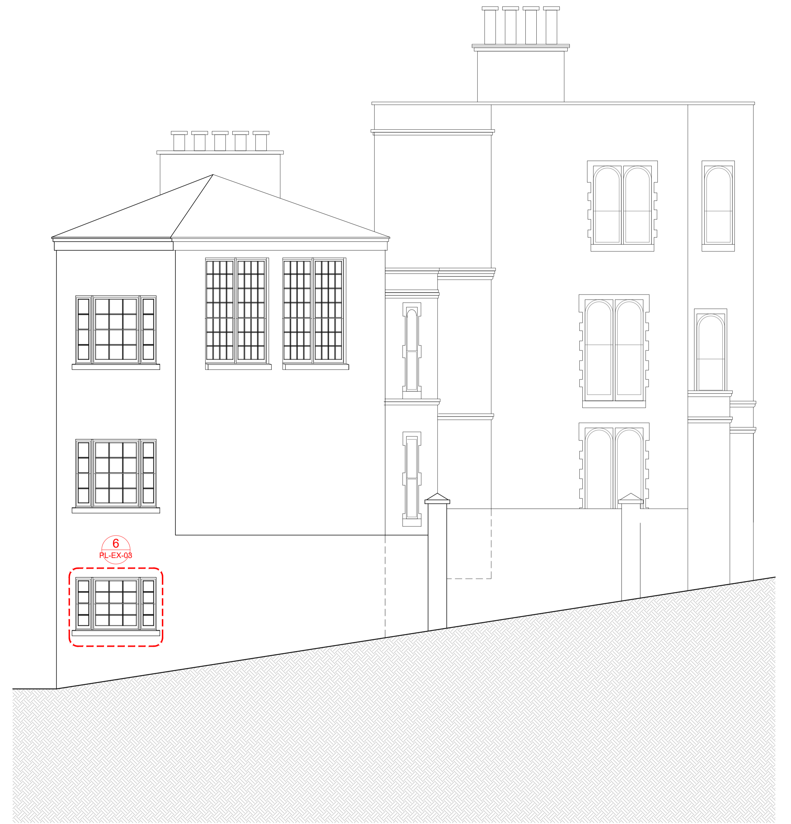
D | EXTERNAL ELEVATION