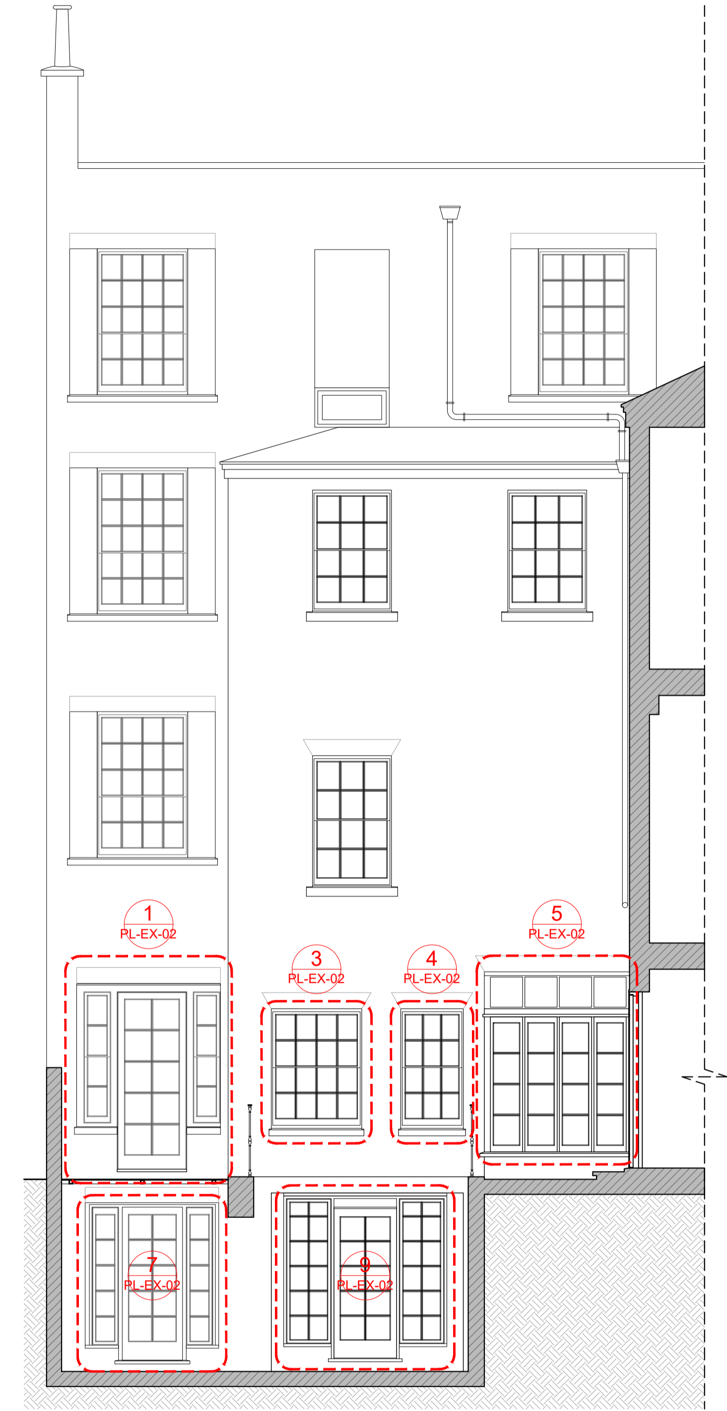
B | EXTERNAL ELEVATION SCALE: 1:50 (A1) / 1:100 (A3)