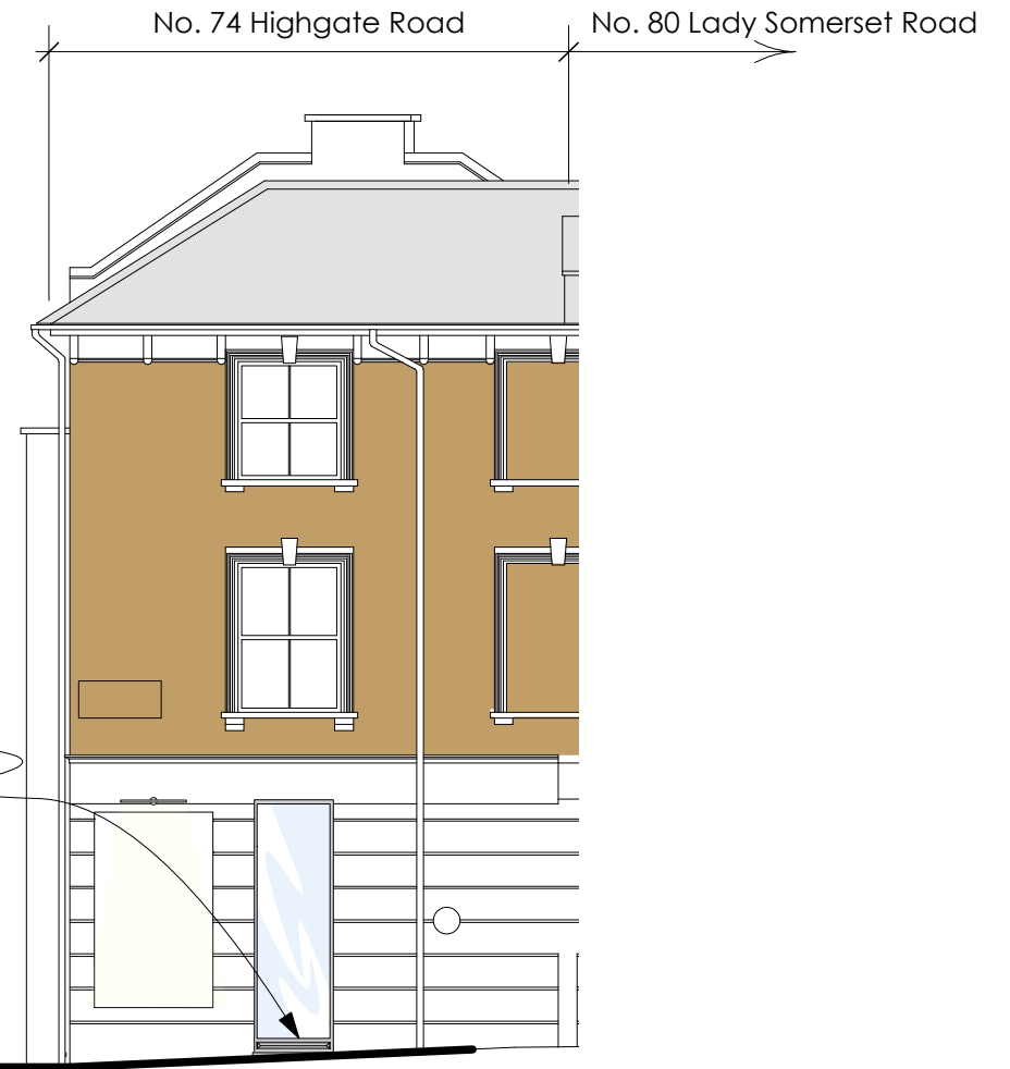
1 Proposed Elevation to Highgate Road Scale: 1:100