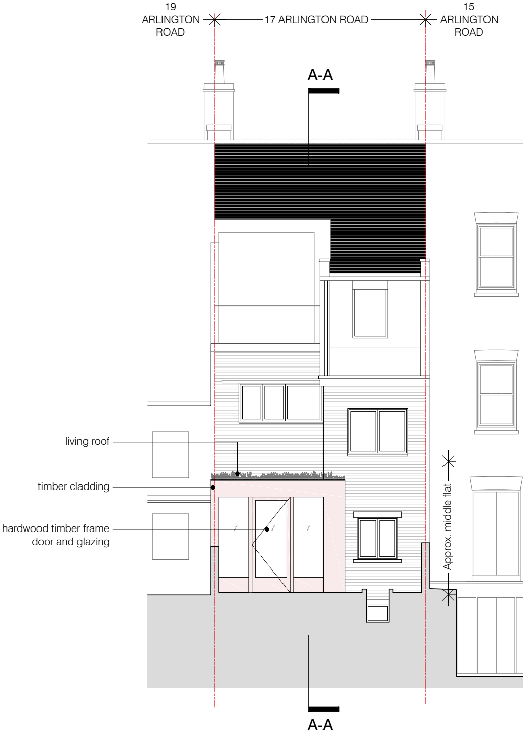
01 PROPOSED REAR ELEVATION scale 1:100