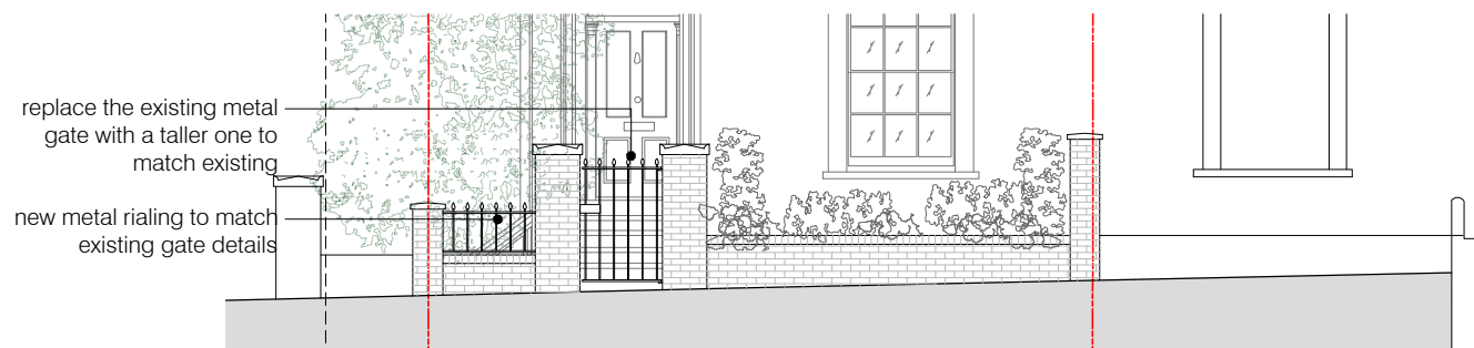
03 PROPOSED STREET ELEVATION scale 1:100