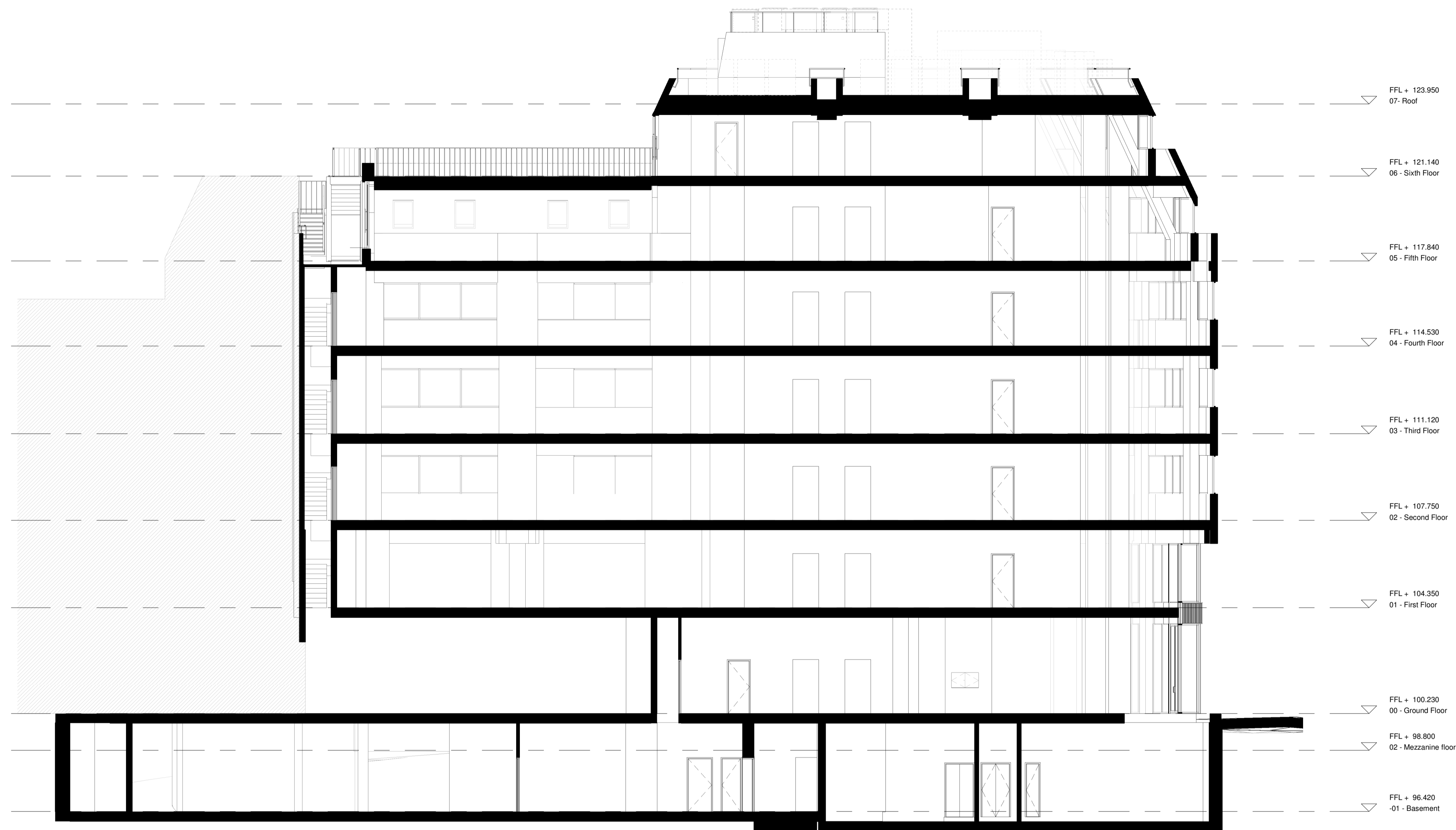
1 Proposed Section A-A 1 : 100

Do not scale from this drawing, except for planning purposes. Check all dimensions on site. Subject to survey. Subject to site inspection. Site boundary lines are indicative only.