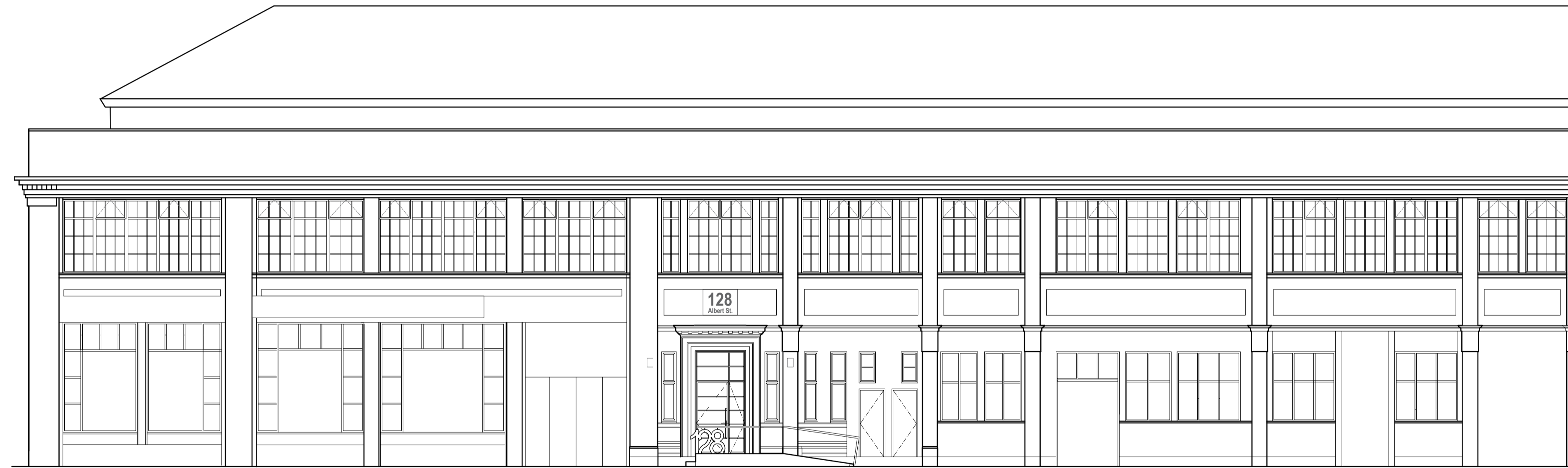
○ Albert St Elevation B 1:100