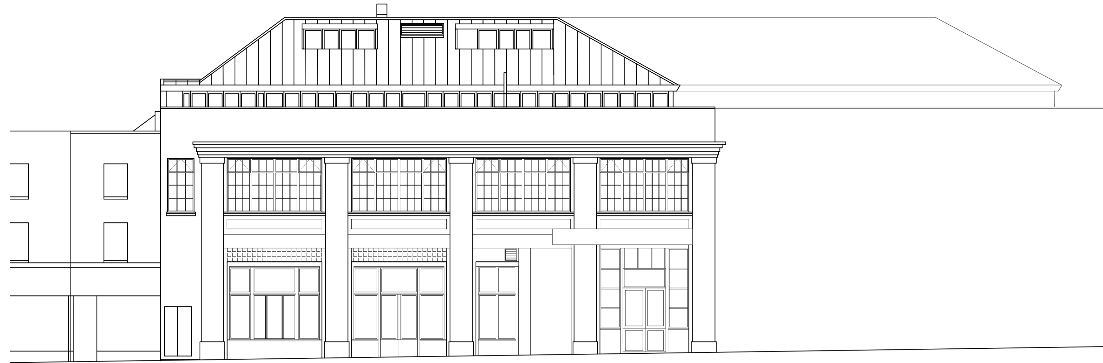
○ Parkway Elevation A 1:100