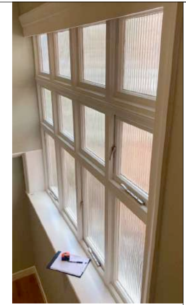
Window TYPE B - EXISTING