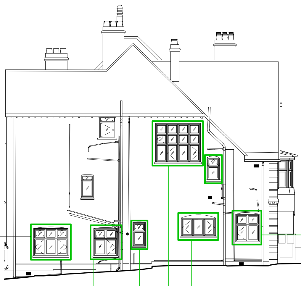
2 EXISTING SIDE ELEVATION Scale 1:125 @ A3