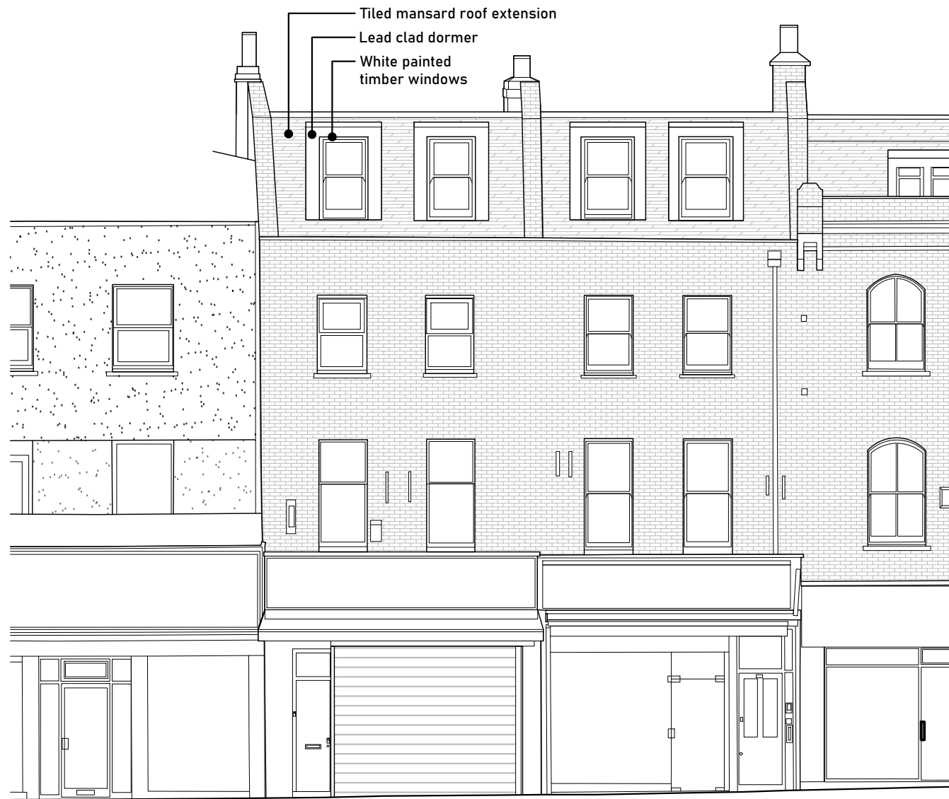
Proposed Front Elevation Scale 1:100 @ A3