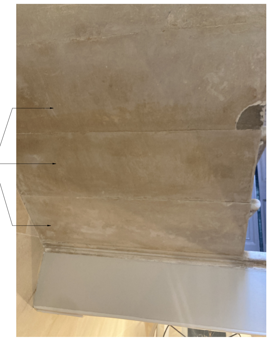
PHOTO P2 UNDERSIDE VIEW OF STAIRS