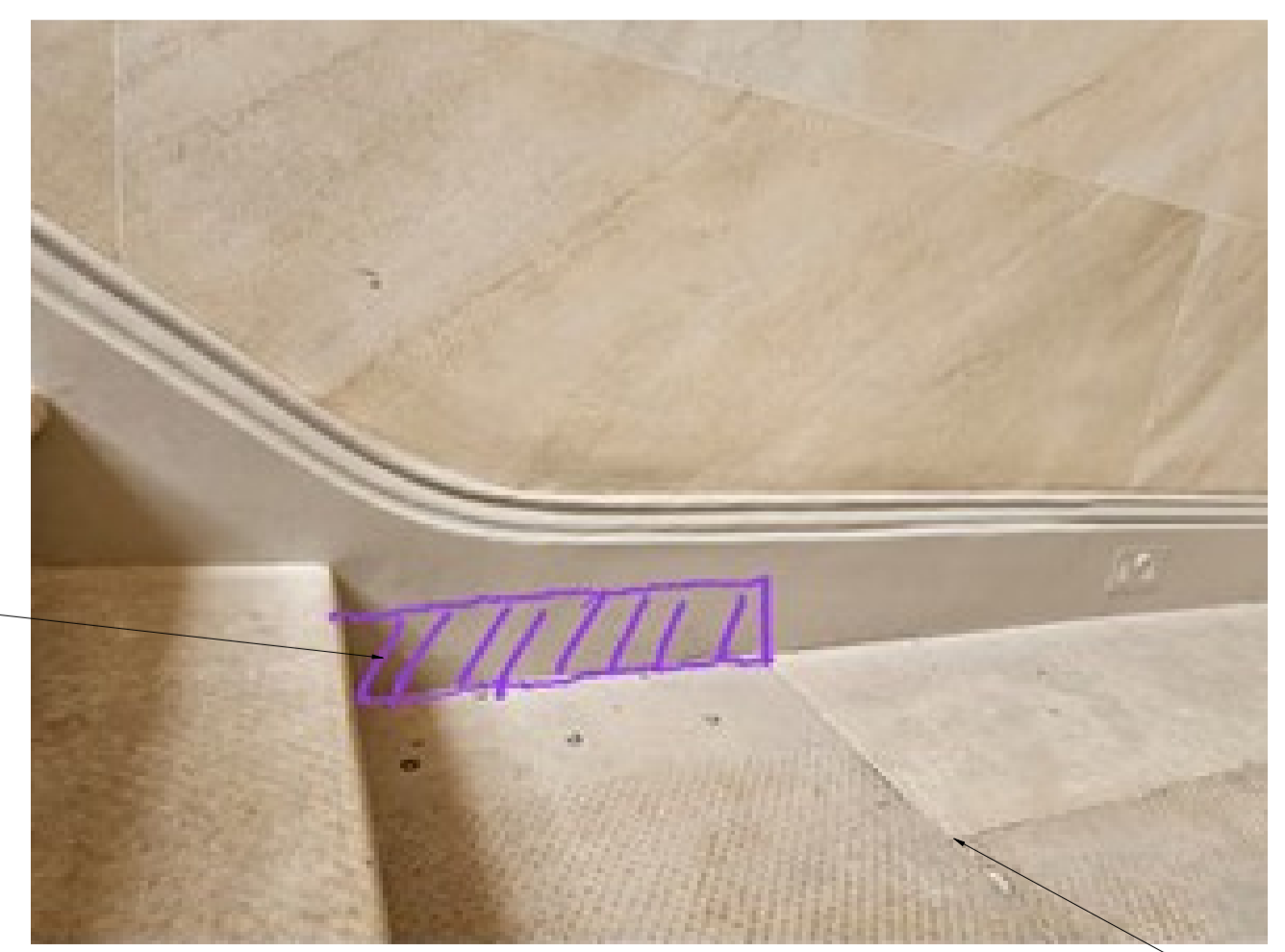
PHOTO P1 VIEW OF SKIRTING BOARD AT LANDING LEVEL.