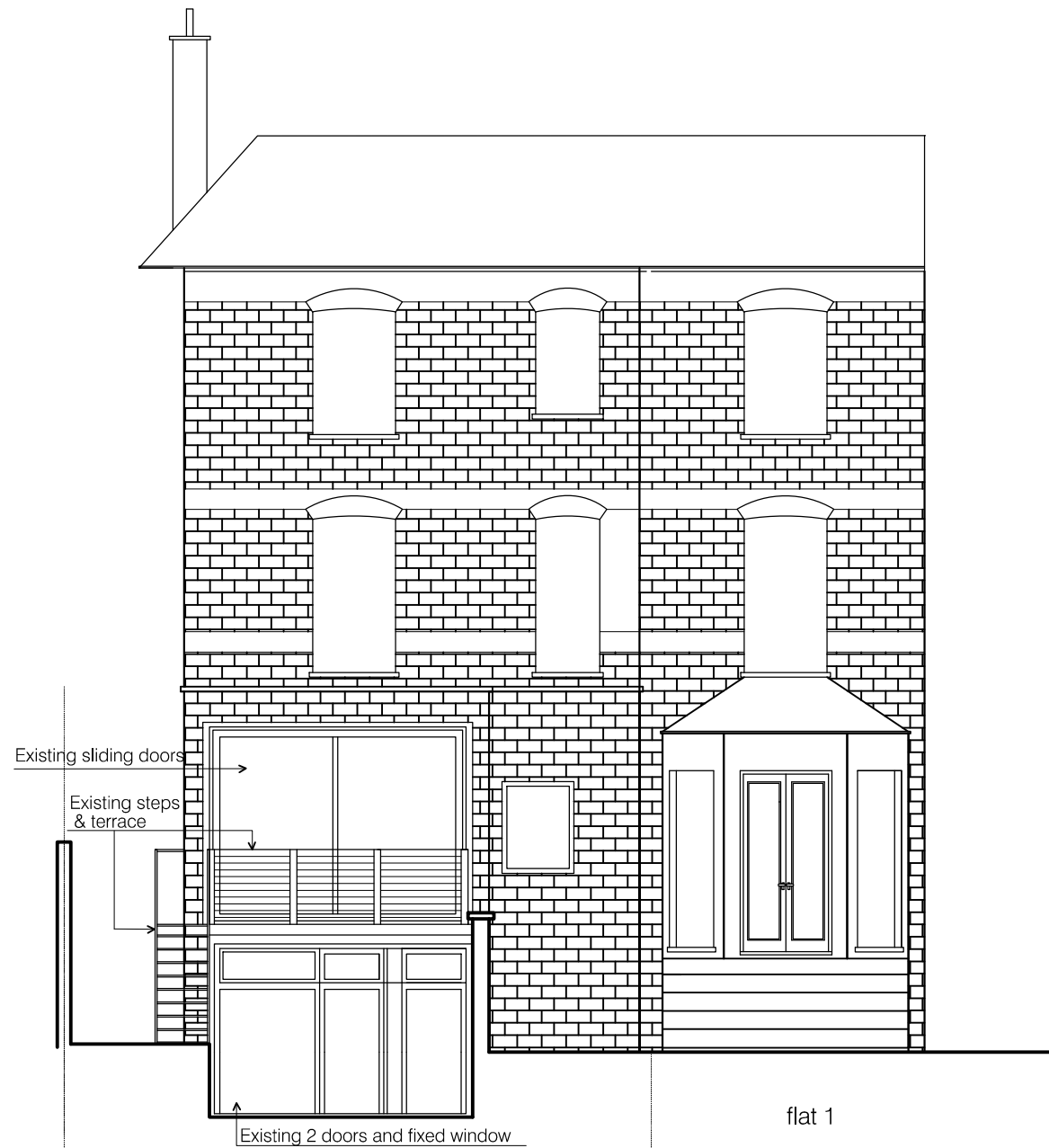
REAR ELEVATION/ SOUTH AS EXISTING ( flat 2)