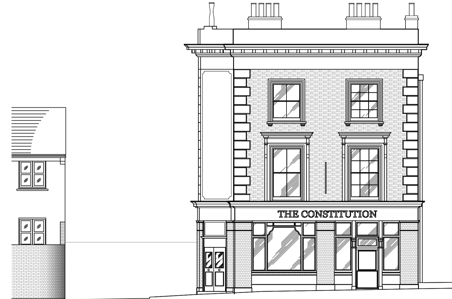
WEST ELEVATION Scale: 1:100