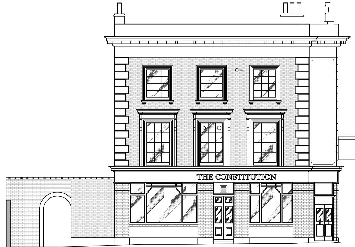
NORTH ELEVATION Scale: 1:100