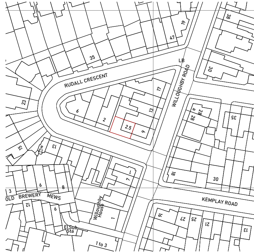
Location Plan Scale 1:1250 @ A3