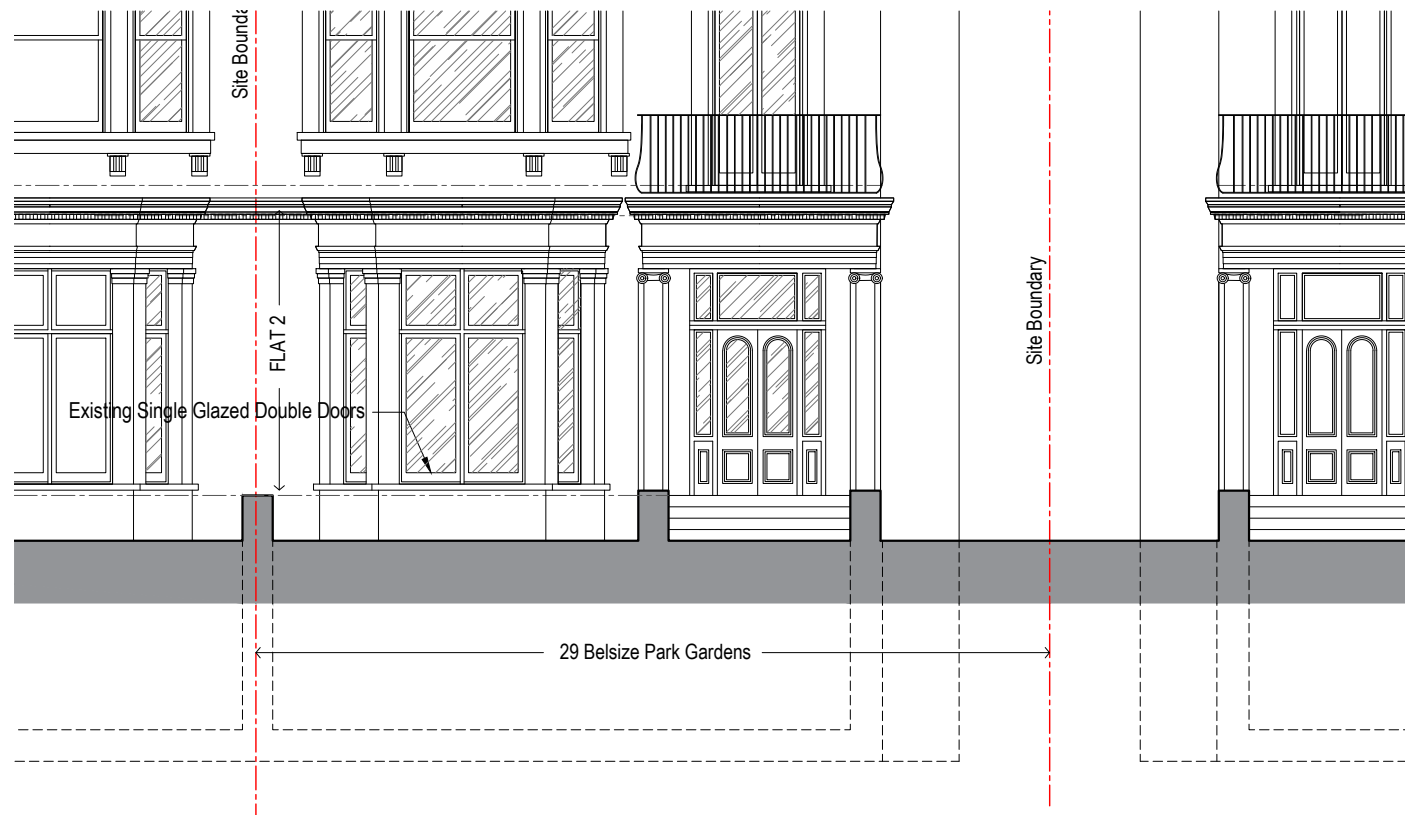
Existing Front Elevation - Flat 2