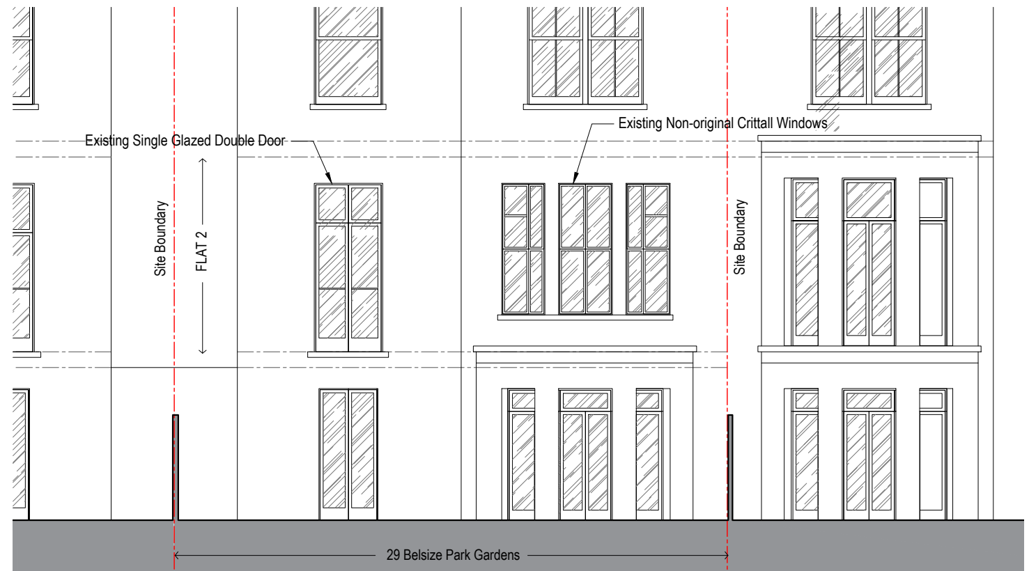
Existing Rear Elevation - Flat 2