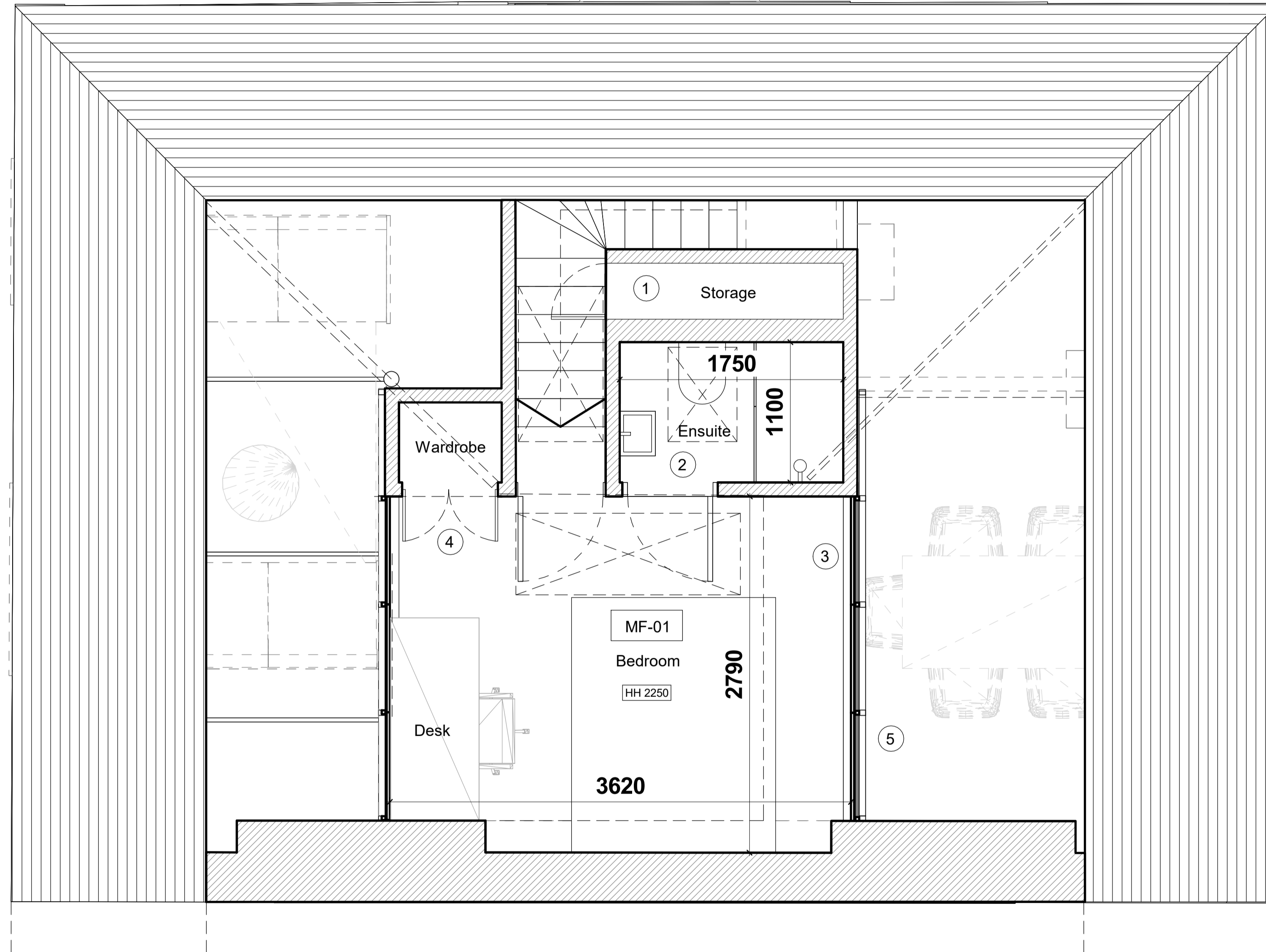
1 Mezzanine Floor Plan 1:25