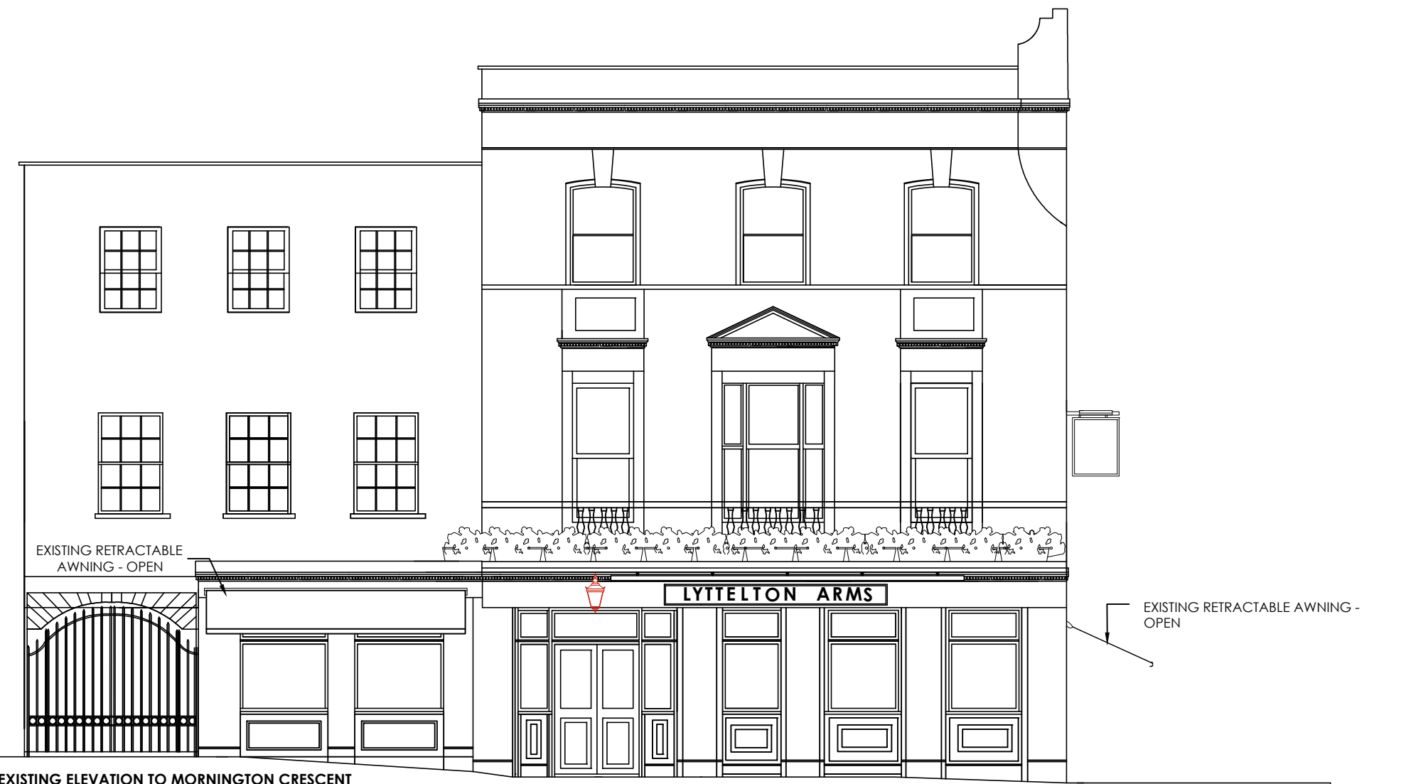
EXISTING ELEVATION TO MORNINGTON CRESCENT AWNINGS OPEN (1:100 )