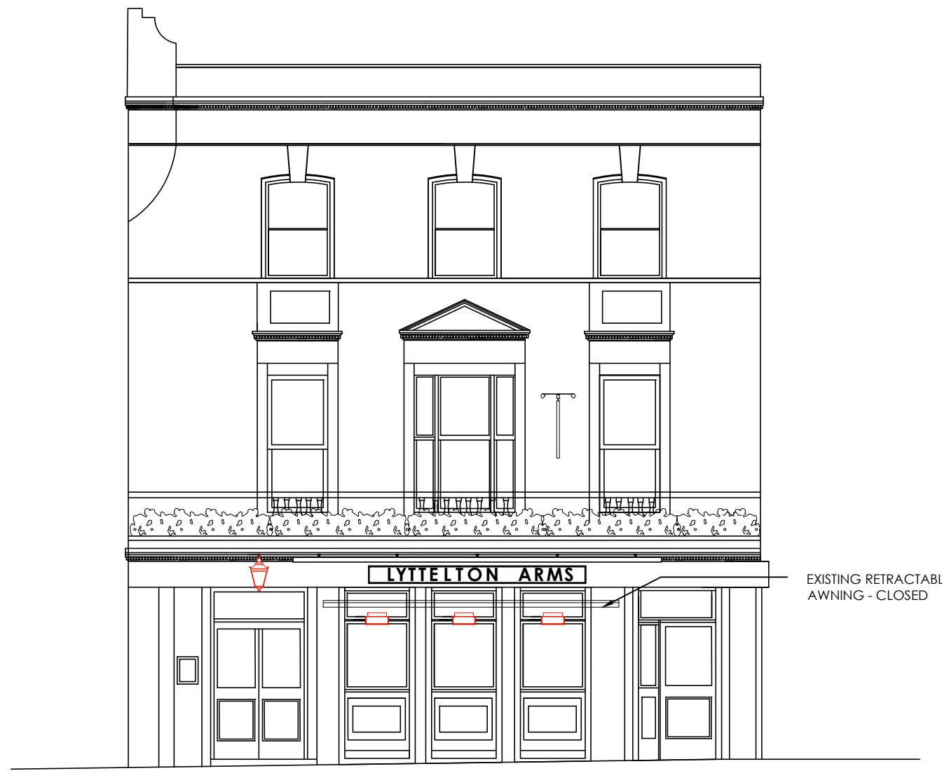
EXISTING ELEVATION TO CAMDEN HIGH STREET AWNINGS CLOSED (1:100 )