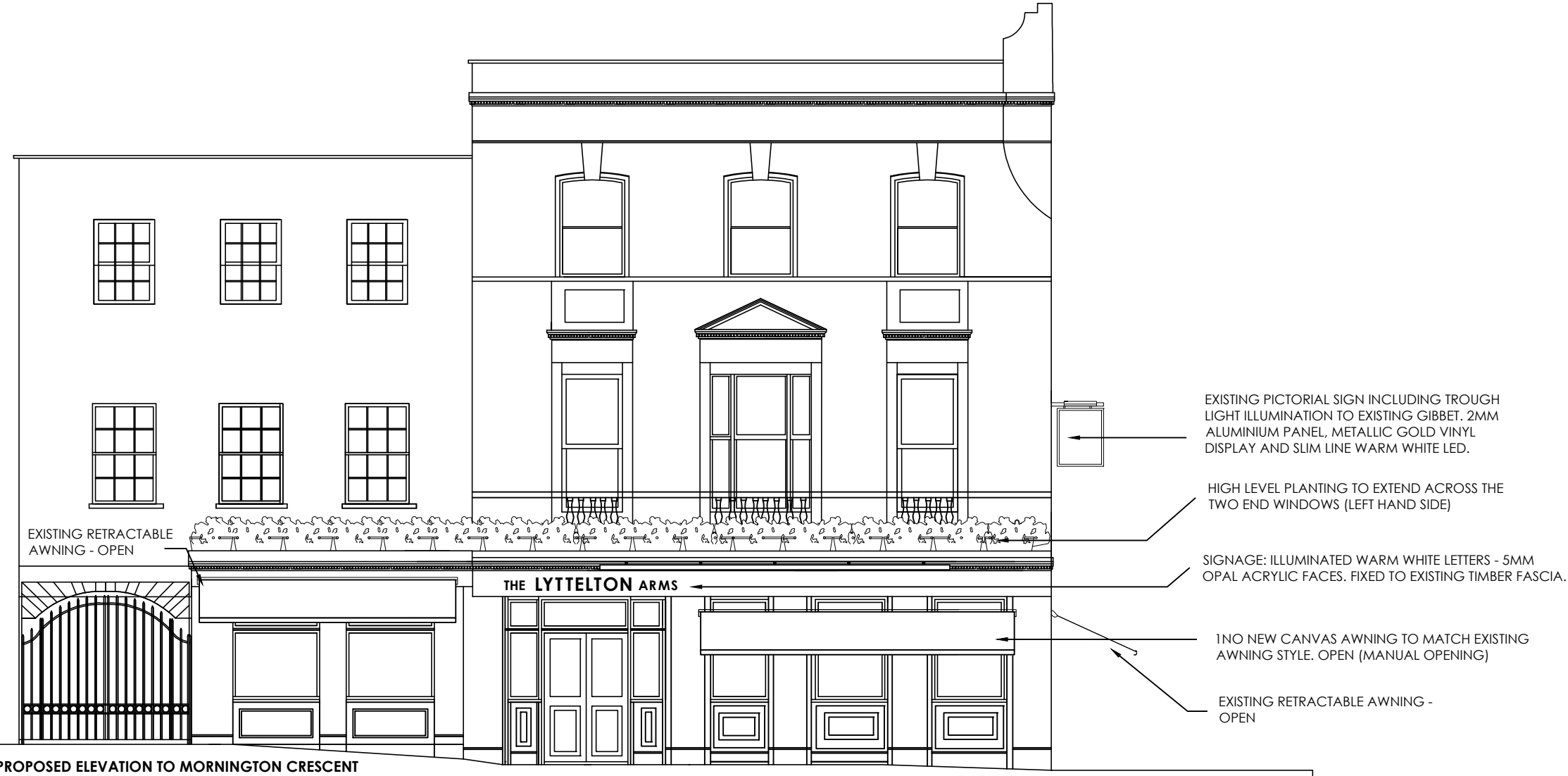
PROPOSED ELEVATION TO MORNINGTON CRESCENT AWNINGS OPEN (1:100 )