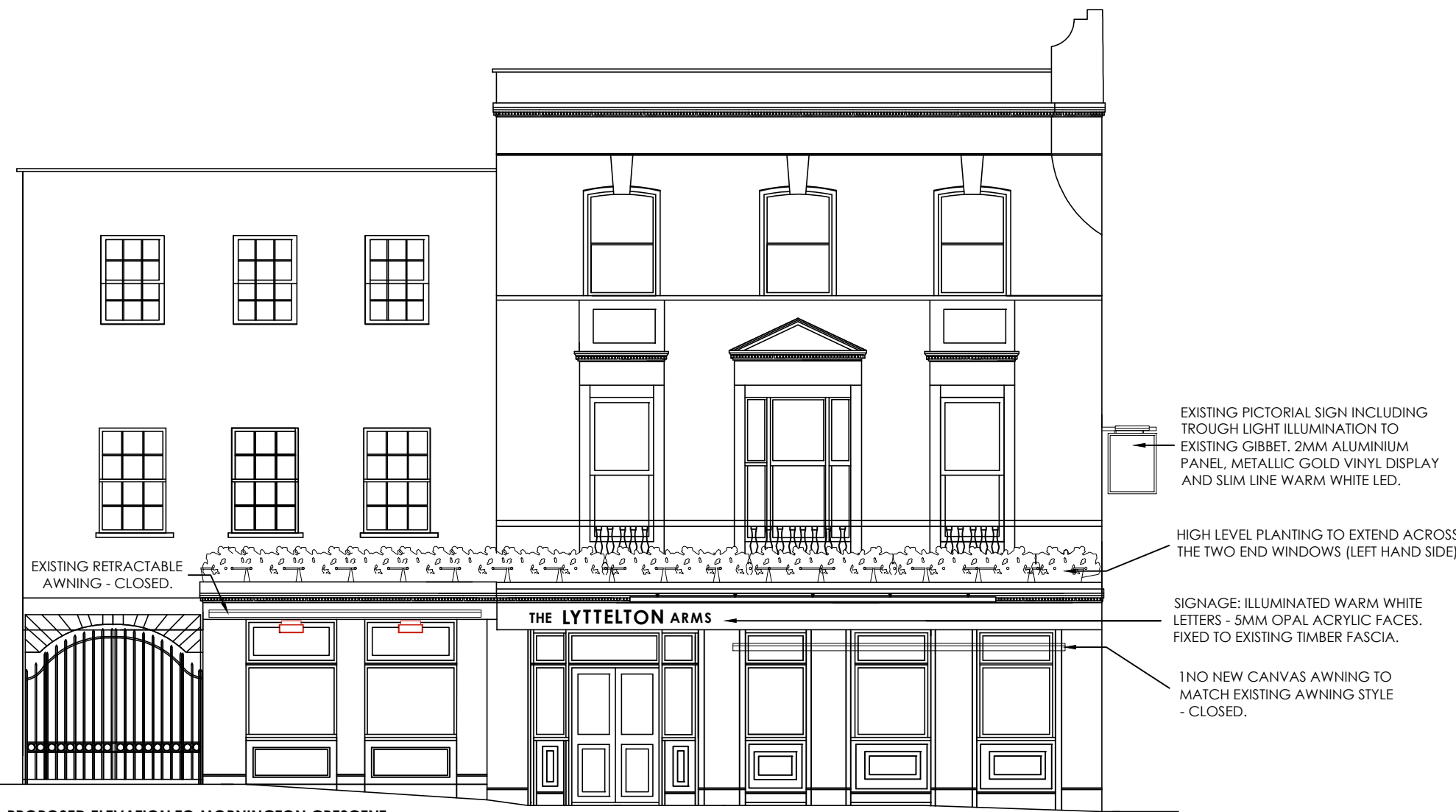
PROPOSED ELEVATION TO MORNINGTON CRESCENT AWNINGS CLOSED (1:100 )