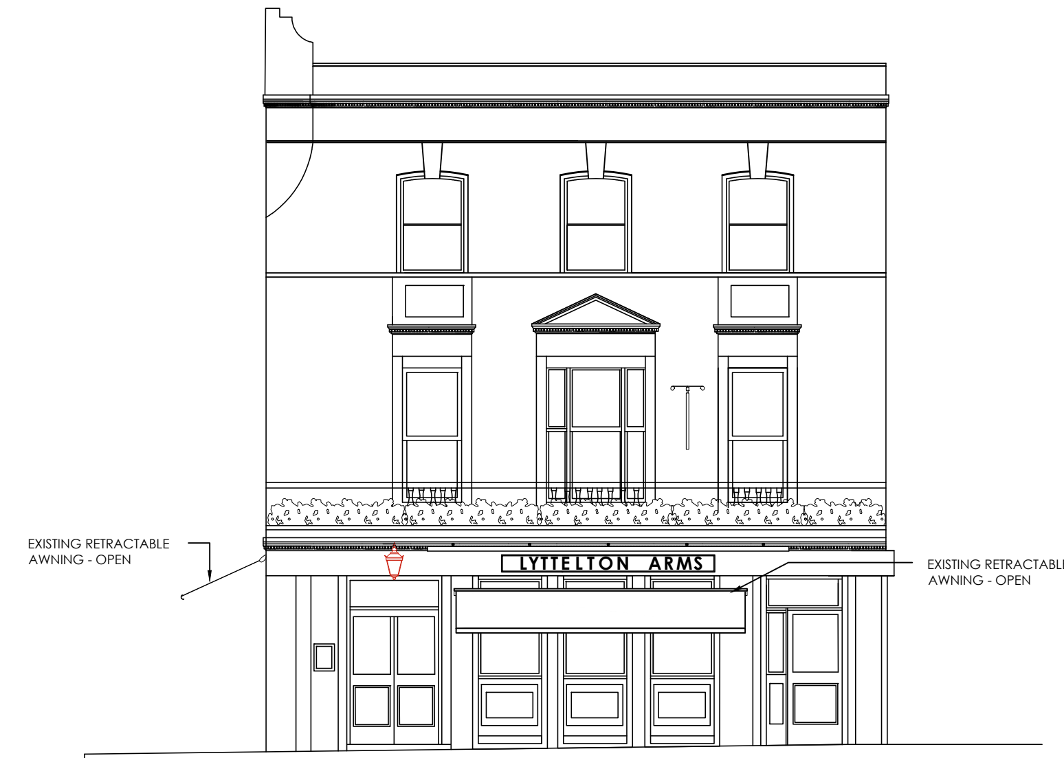
EXISTING ELEVATION TO CAMDEN HIGH STREET AWNINGS OPEN (1:100 )