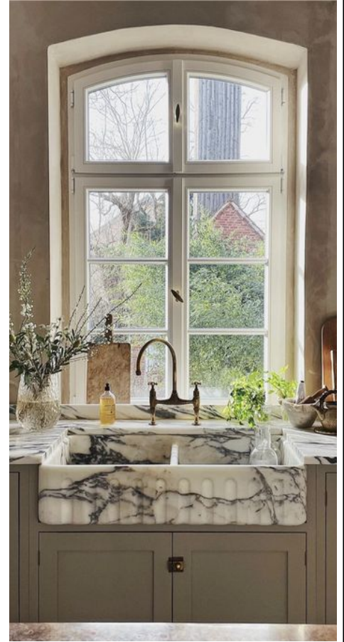
Reference - Sink unit in front of existing window

Income cold/hot water and waste pipe hidden under sink