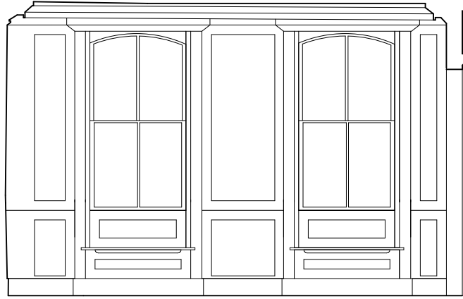
Existing internal elevation - GF