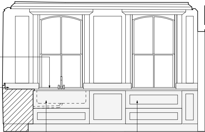
Proposed internal elevation - GF

Proposed reduced splashback to read the window behind Proposed splashback fixed to freestanding low-level kitchen cabinet to protect the wall finishes Proposed freestanding low-level kitchen cabinet.