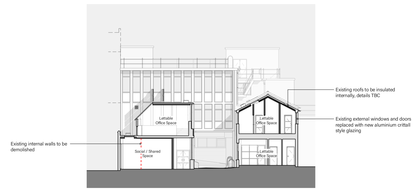
SECTION D-D No Survey Reference