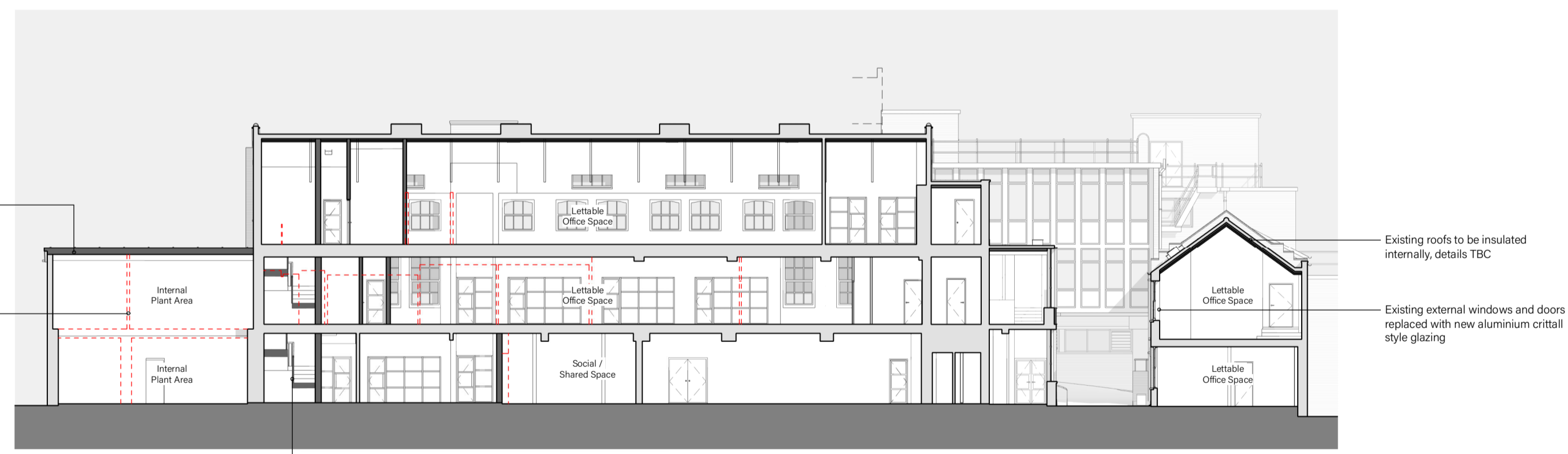
SECTION B-B Midland Survey 34510 / 15