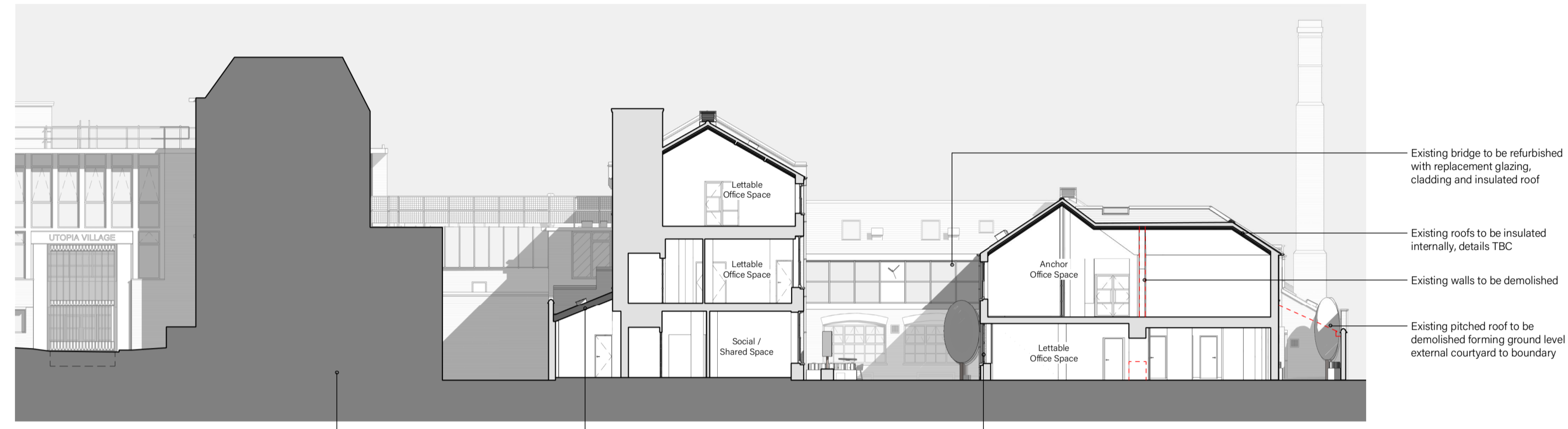
SECTION A-A Midland Survey 34510 / 15