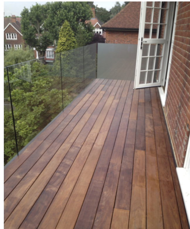
THE PROPOSED NEW TERRACE ON THE GROUND FLOOR WILL BE IDENTICAL IN APPEARANCE AND USE OF MATERIALS TO THE EXISTING FIRST FLOOR TERRACE