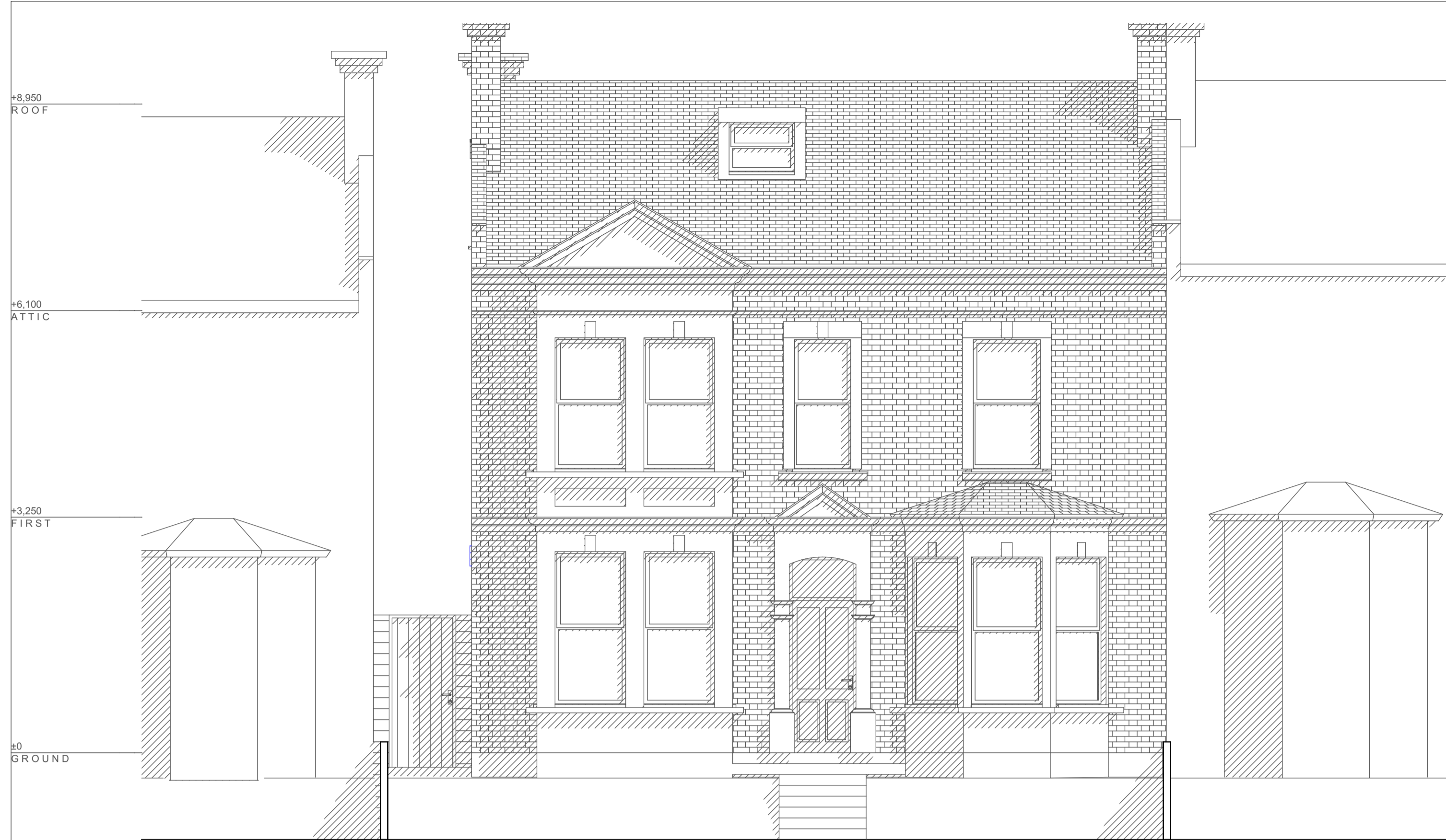
PROPOSED SOUTH ELEVATION 1:50

Materials to match existing unless otherwise stated on the drawings. Any rooflights not to project more than 150mm from the plane of the roof