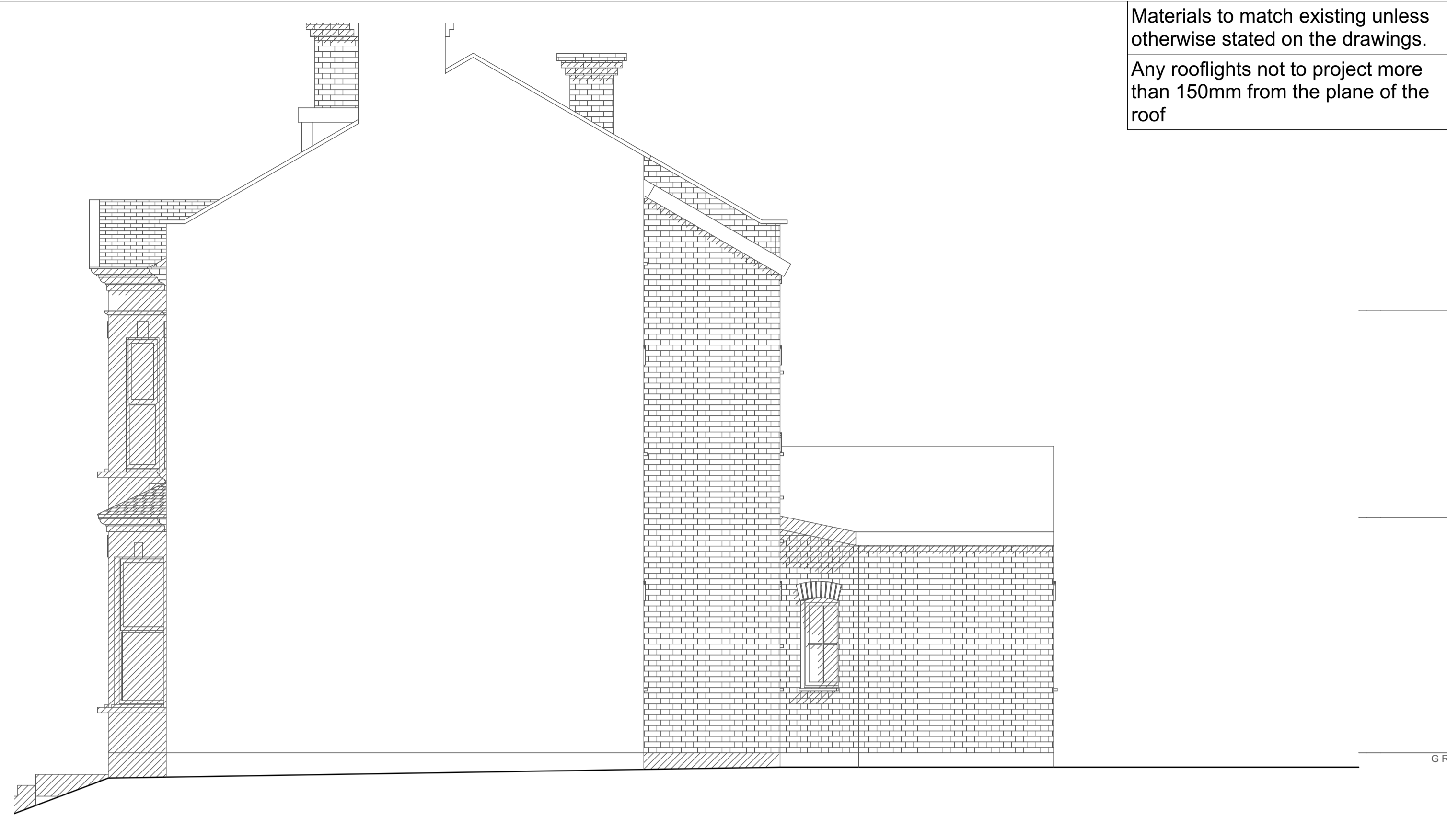
PROPOSED EAST ELEVATION 1:50