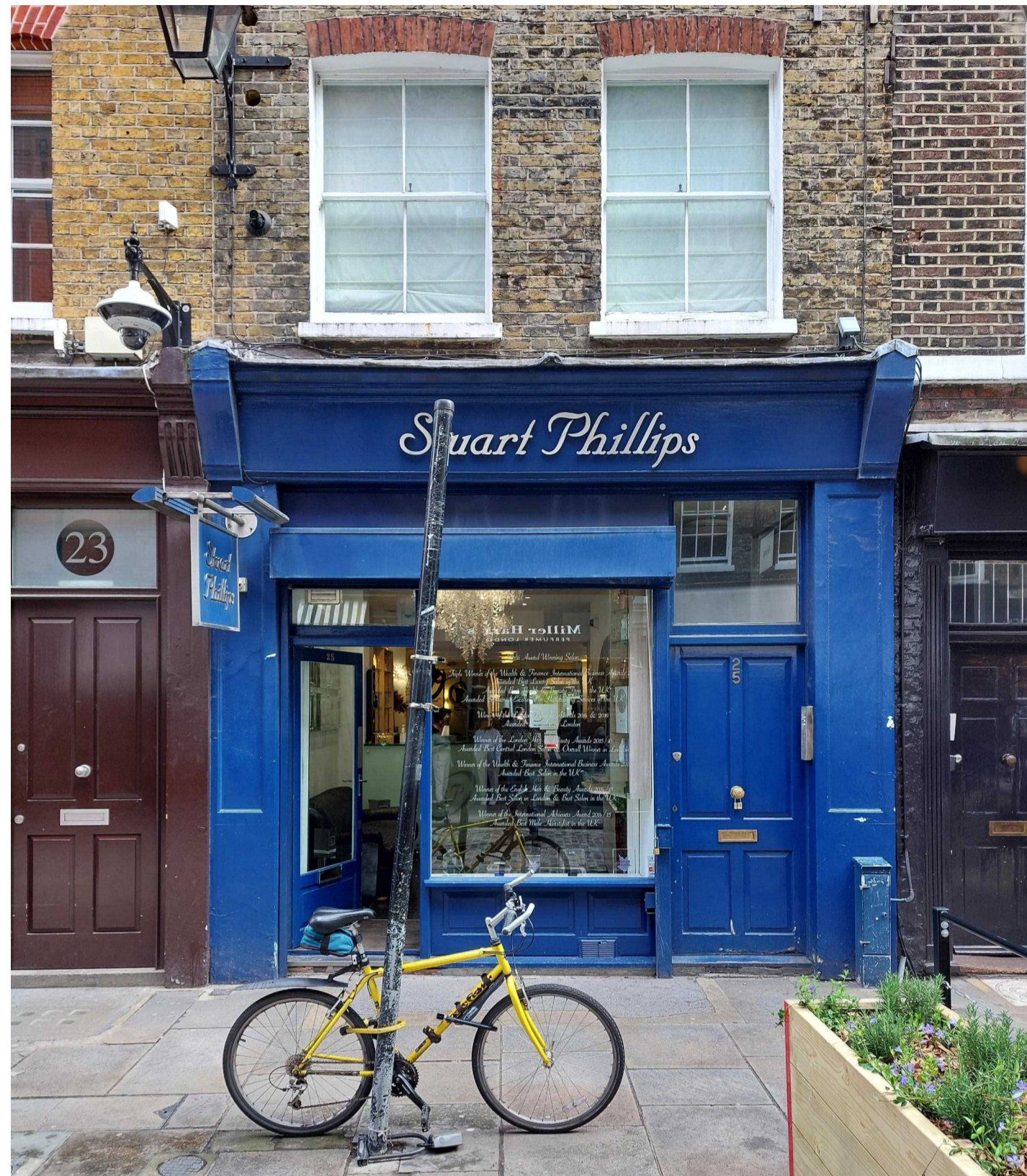
EXISTING SHOPFRONT VIEW FROM MONMOUTH ST. SCALE: NIS