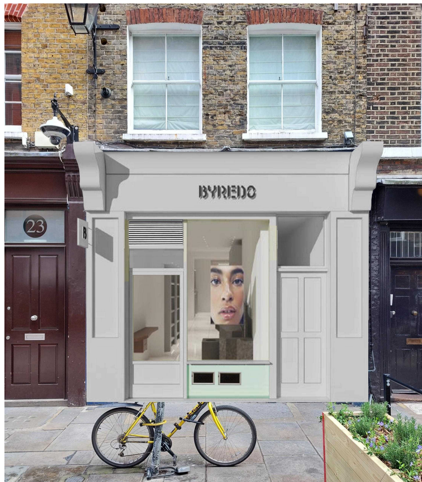
PROPOSED SHOPFRONT VIEW FROM MONMOUTH ST. SCALE: NIS