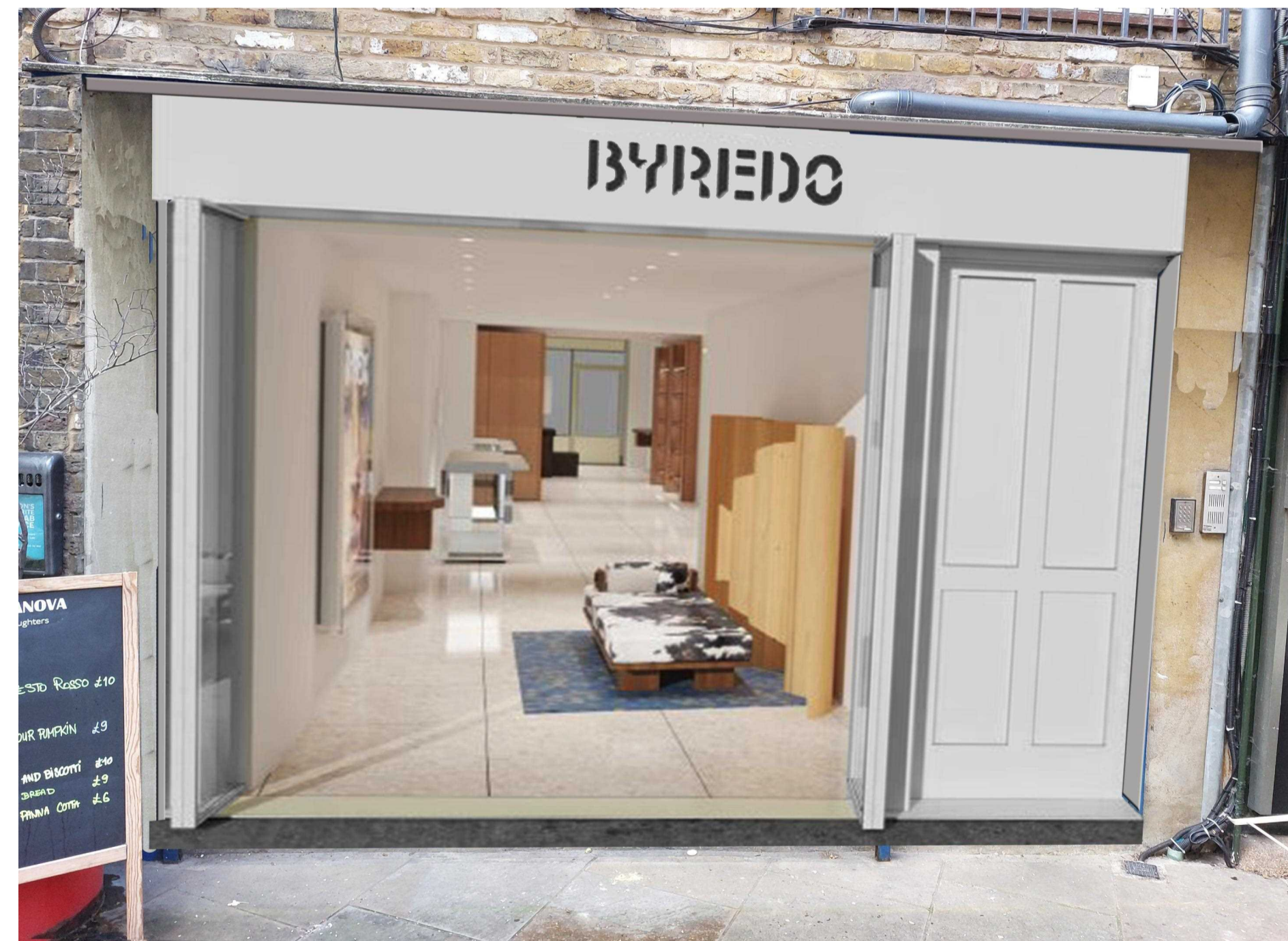
PROPOSED SHOPFRONT VIEW FROM NEAL'S YARD SCALE: NIS