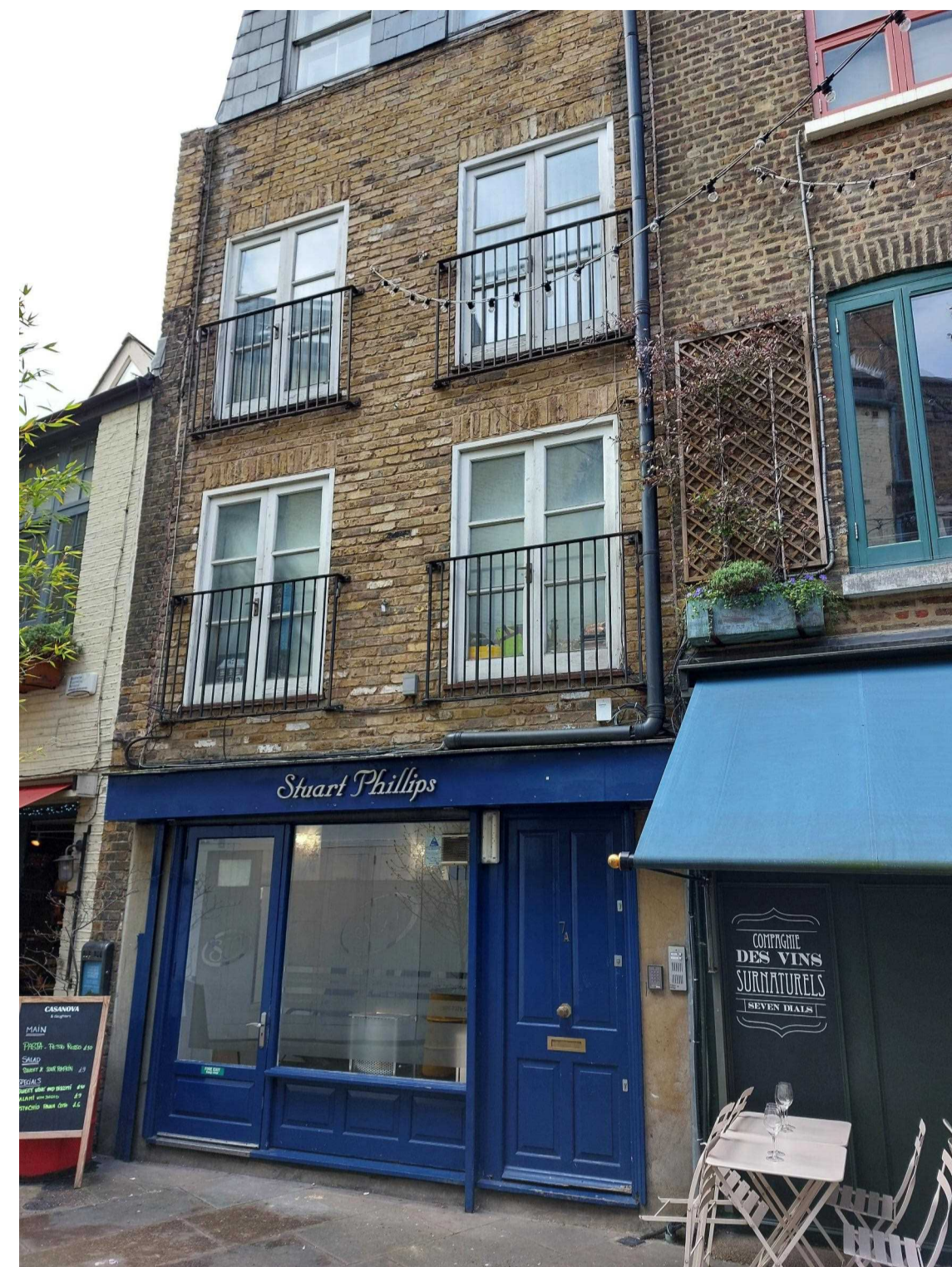
EXISTING SHOPFRONT WIDE VIEW FROM NEAL'S YARD SCALE: NIS