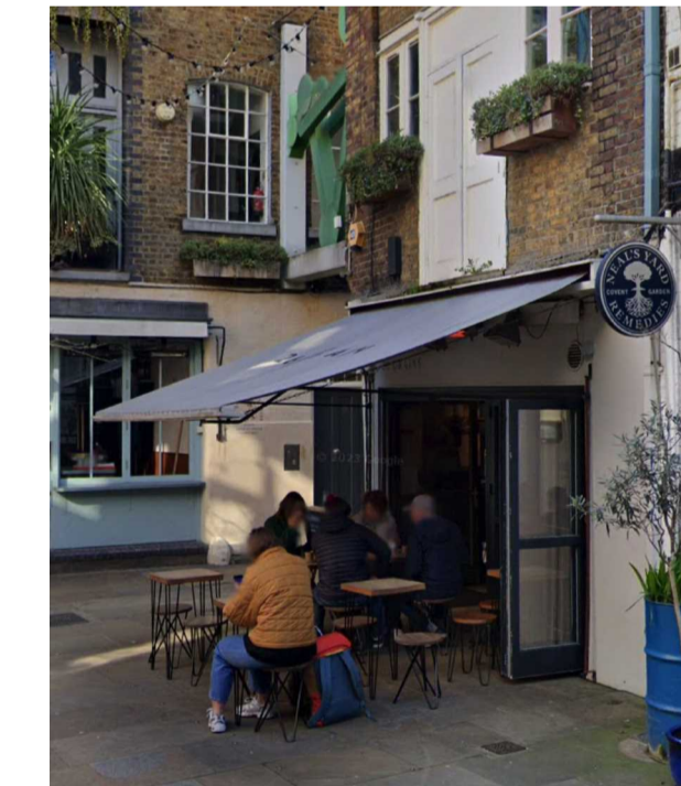
VIEW FROM NEAL'S YARD SHOWING STORES WITH FOLDING DOORS