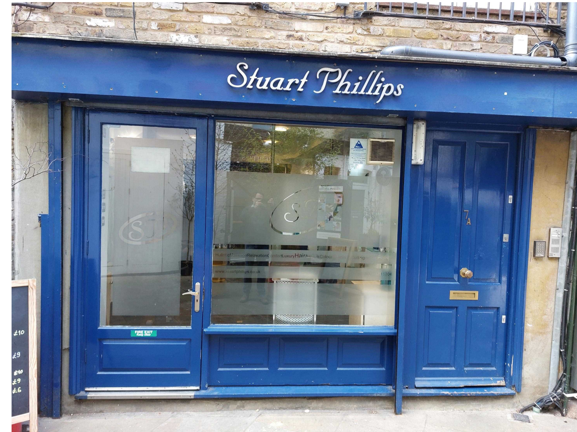
EXISTING SHOPFRONT VIEW FROM NEAL'S YARD SCALE: NIS