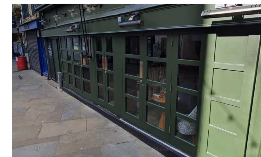
VIEW FROM NEAL'S YARD SHOWING STORES WITH FOLDING DOORS

Notes: All copyrights retained. All information remains the property of Gregori_Chiorotti Projects Ltd. and may not be used for any purpose whatsoever, or reproduced through any medium without the written consent of Gregori_Chiorotti Projects Ltd. No responsibility is accepted for unauthorised use. All information is subject to statutory consents, rights of light and survey. Do not scale from drawings - Use figured dimensions only and verify on site.