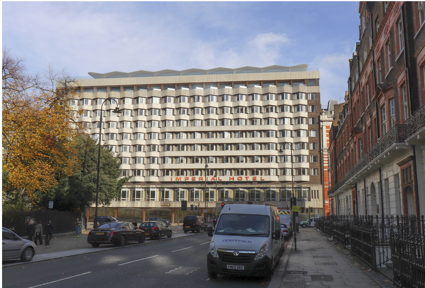
Previous application drawing (P1083) - A 11.04.2019 (APPLICATION REFERENCE: 2019/2985/P)