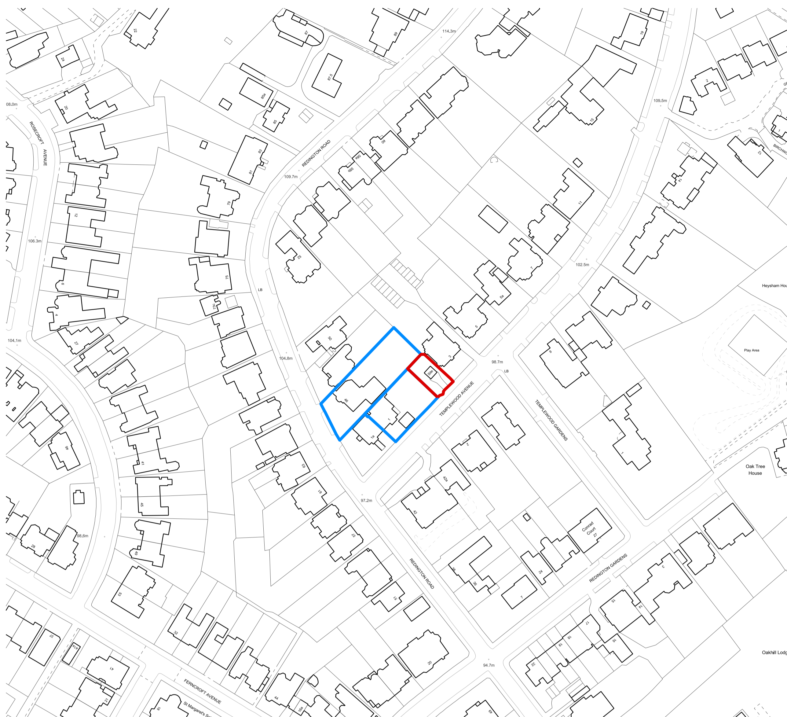
01 Site location Plan 1:1250 @A1