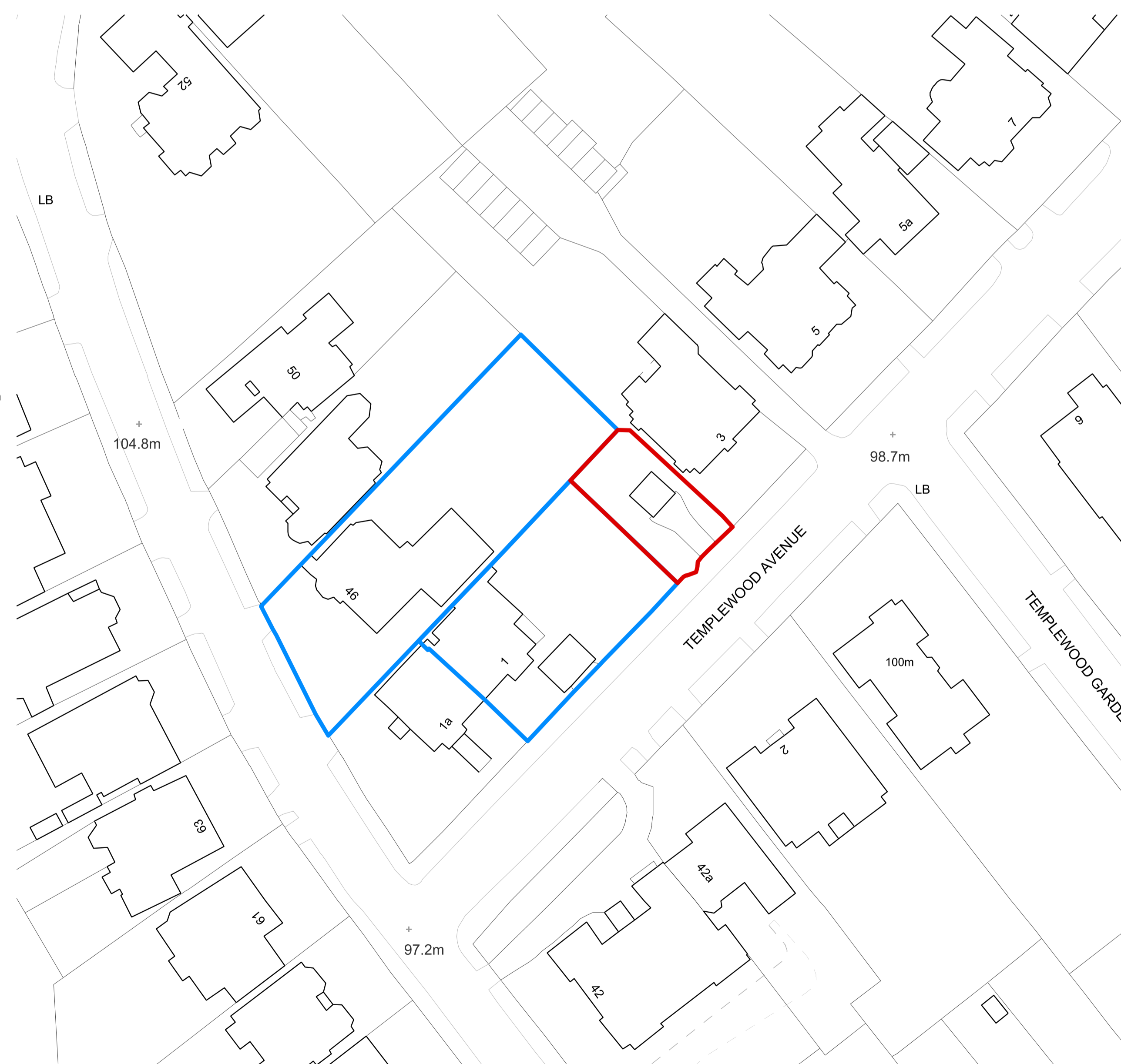
02 SiteBlock Plan 1:500 @A1