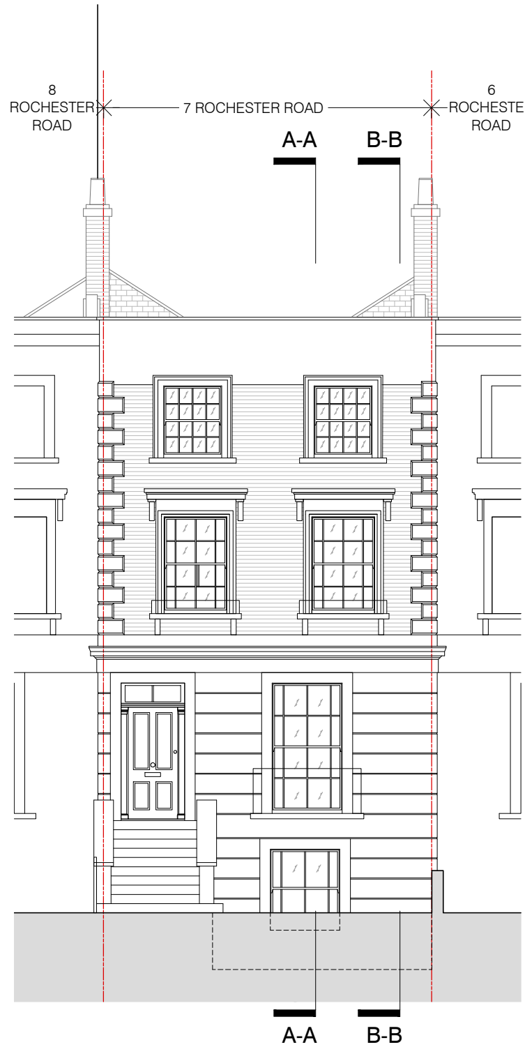
01 PROPOSED FRONT ELEVATION scale 1:100