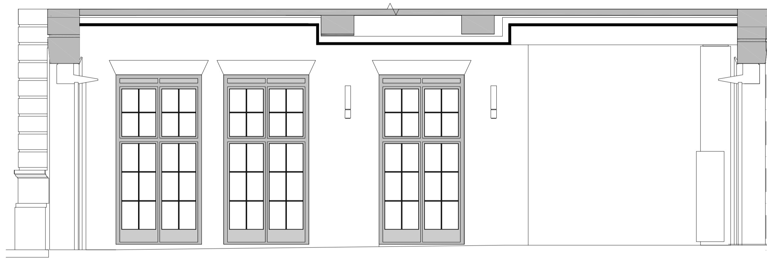
2 EXISTING ELEVATION B Scale: 1:50