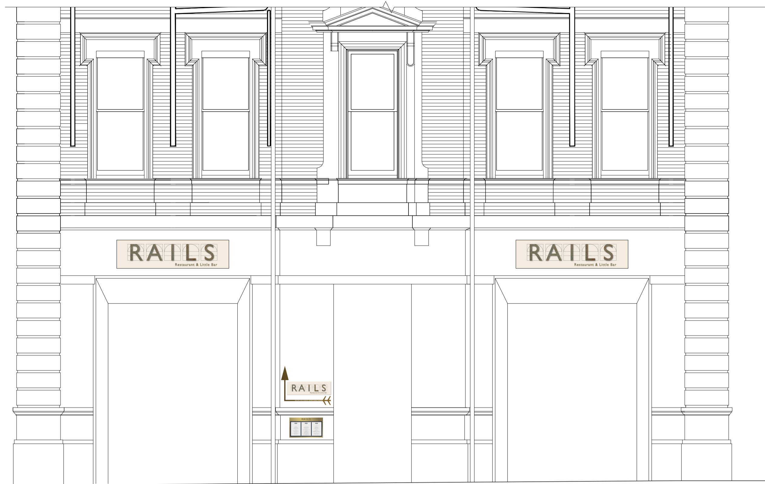
3 EXISTING ELEVATION A Scale: 1:50