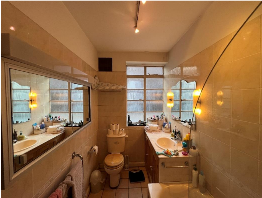
Photos 10, 11 (Plans A-02, A-05, A-06) Bathroom 1– door: At the moment, as shown on A-02 plan, bathroom 1 is en-suite to room 2. It is proposed, to reinstate bathroom's entrance so that it is separated from room 2 and it can be accessed from corridor 1 (please, check plan A-05).