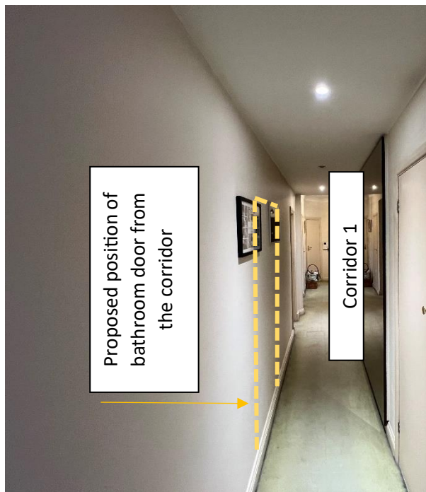
Photo 11: Photo of the existing corridor. It is proposed to access bathroom 1 from the corridor (reinstate bathroom 1) instead from room 2 as it is today (A-05).

Photo 12 (A-02, A-05, A-07) Corridor 1 – closet space: It is proposed to remove the existing wall at corridor 1 as shown below and at A-04, A-05 plans and build a new one at a new position (as shown at A-05, A-07 plans), so as to create a large storage space at the corridor, following the existing closet/storage at the corridor.