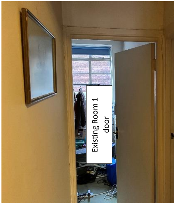
Photo 7 – Existing room 1 door, access from corridor 2. It is proposed to move this door forward as per plan A-05, so that bathroom 2 (with the proposed change of its door) will be en-suite to room 1.