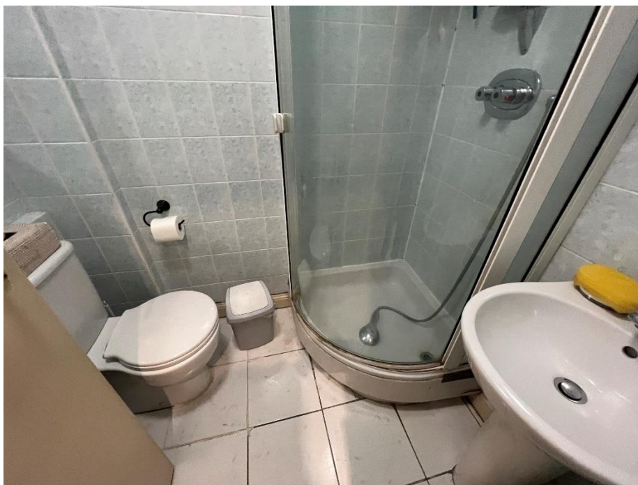
Photo 8 (Plan A-02) – Bathroom 2 (Internal photos): It is proposed to replace the existing tiles and sanitary ware with new ones.