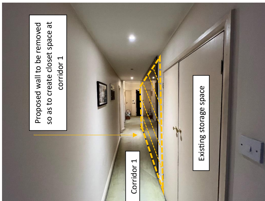
Photo 12 (A-02, A-05, A-07) Corridor 1 – closet space: It is proposed to remove the existing wall at corridor 1 as shown below and at A-04, A-05 plans and build a new one at a new position (as shown at A-05, A-07 plans), so as to create a large storage space at the corridor, following the existing closet/storage at the corridor.