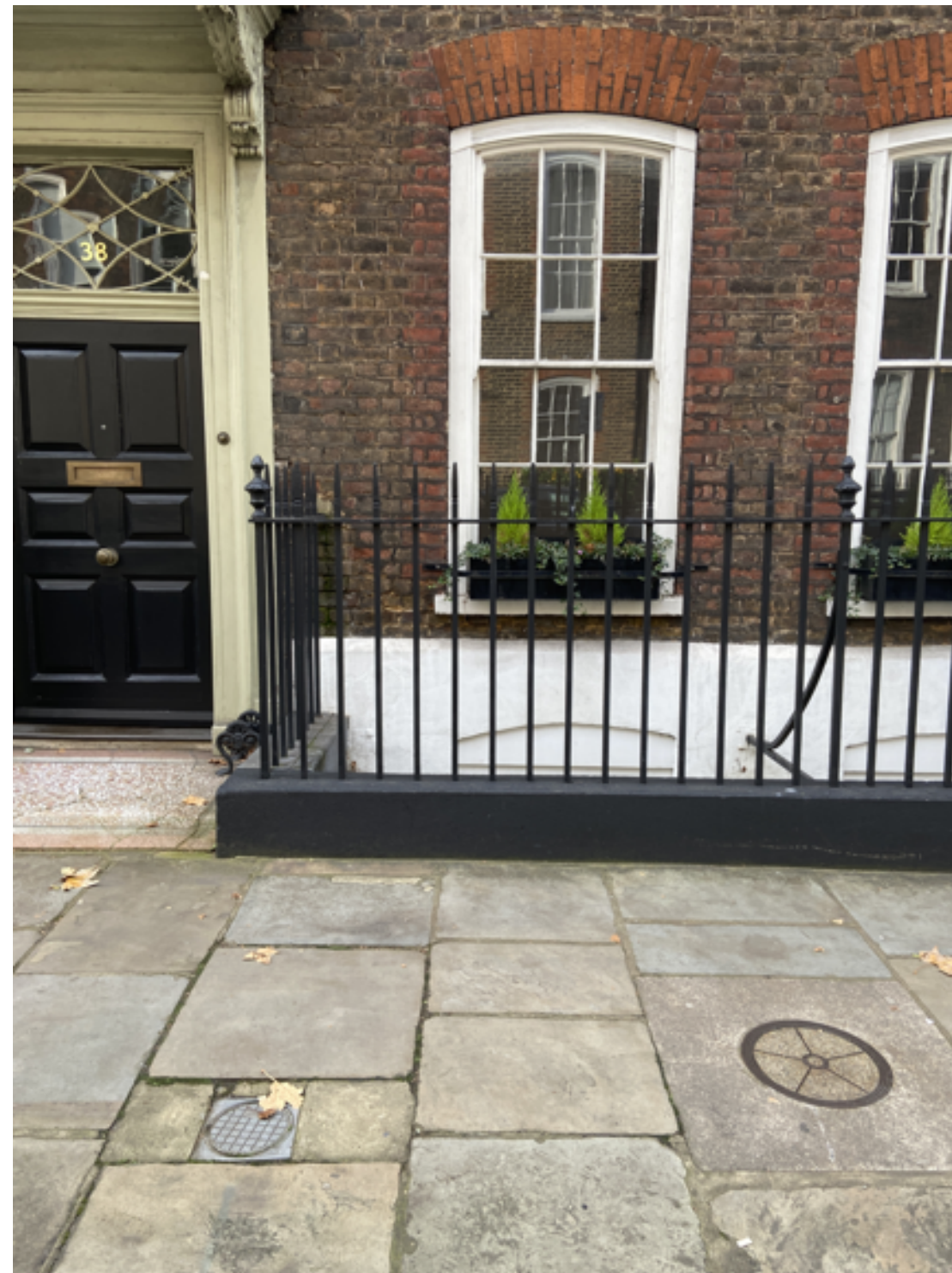
Existing railing at 37 Great James Street