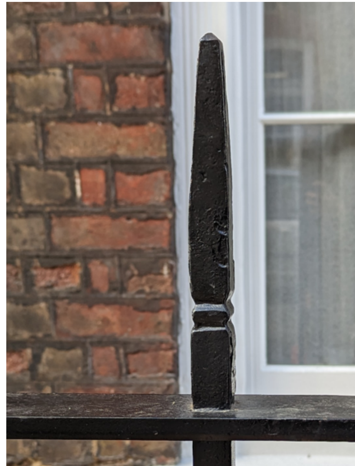
Existing finials at 37 Great James Street