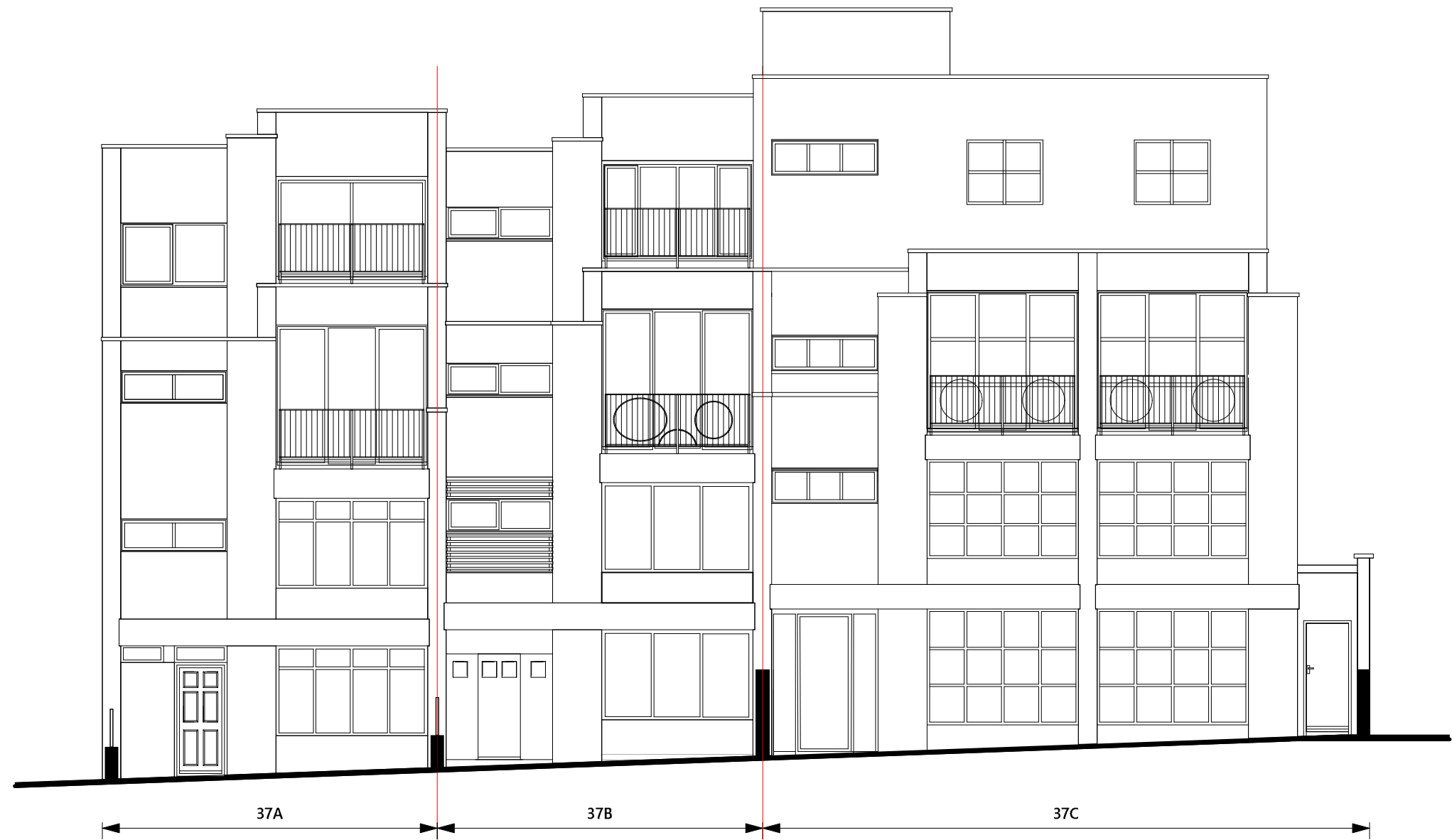
Front Elevation (No change)