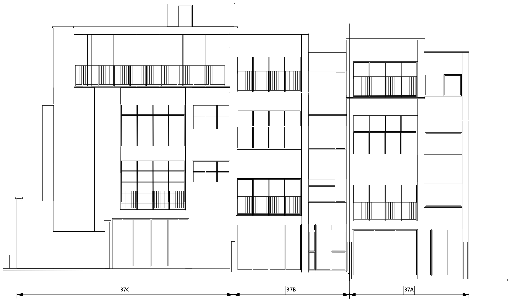
Rear Elevation (No change)