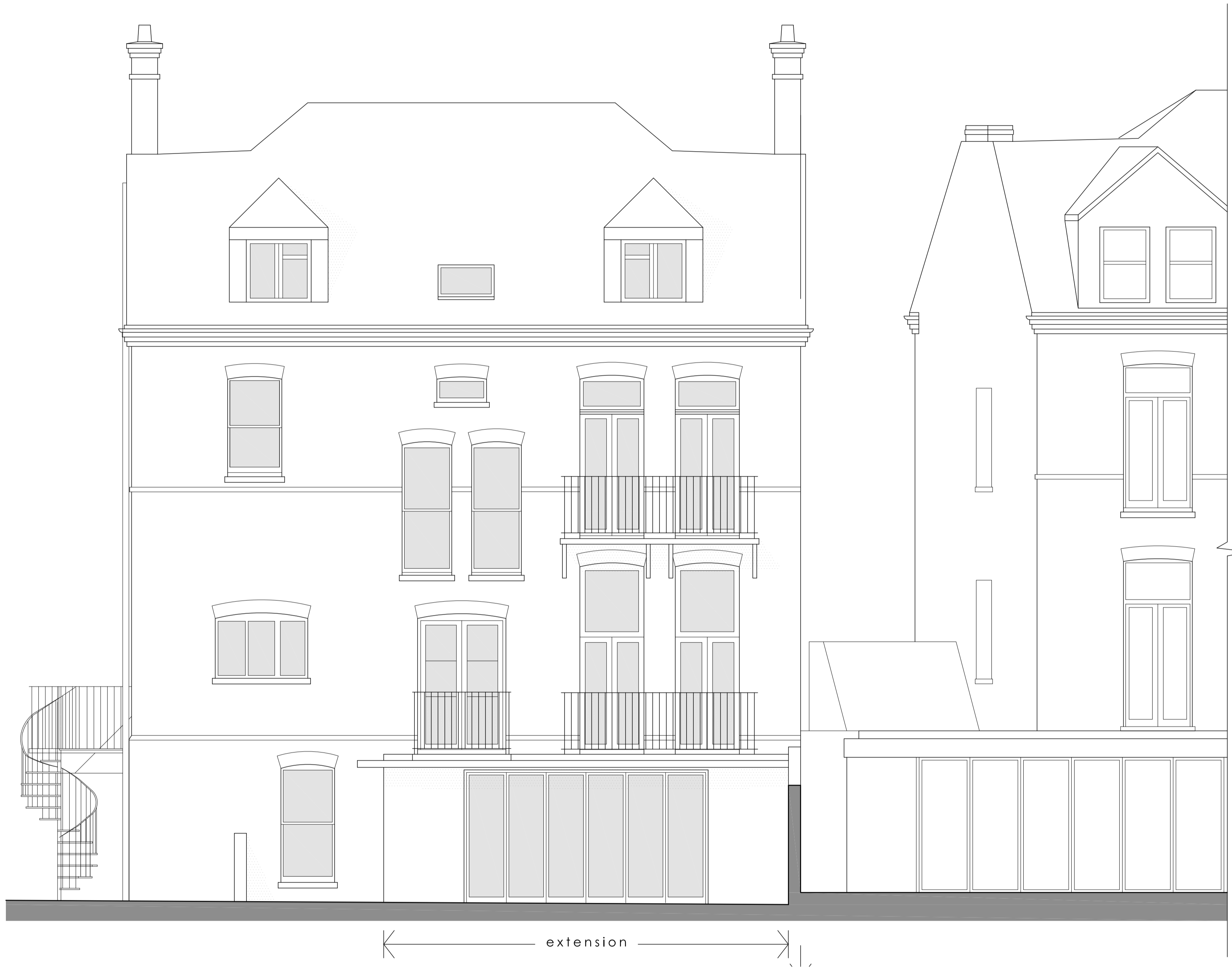
North East elevation to rear garden

walls : red multi stock brickwork to match existing windows: dark grey coated frames with clear glass fascia & eaves: dark grey coated metal roof: living sedum green roof rainwater goods: dark grey coated plastic external surfaces: permeable slabs softened bedded