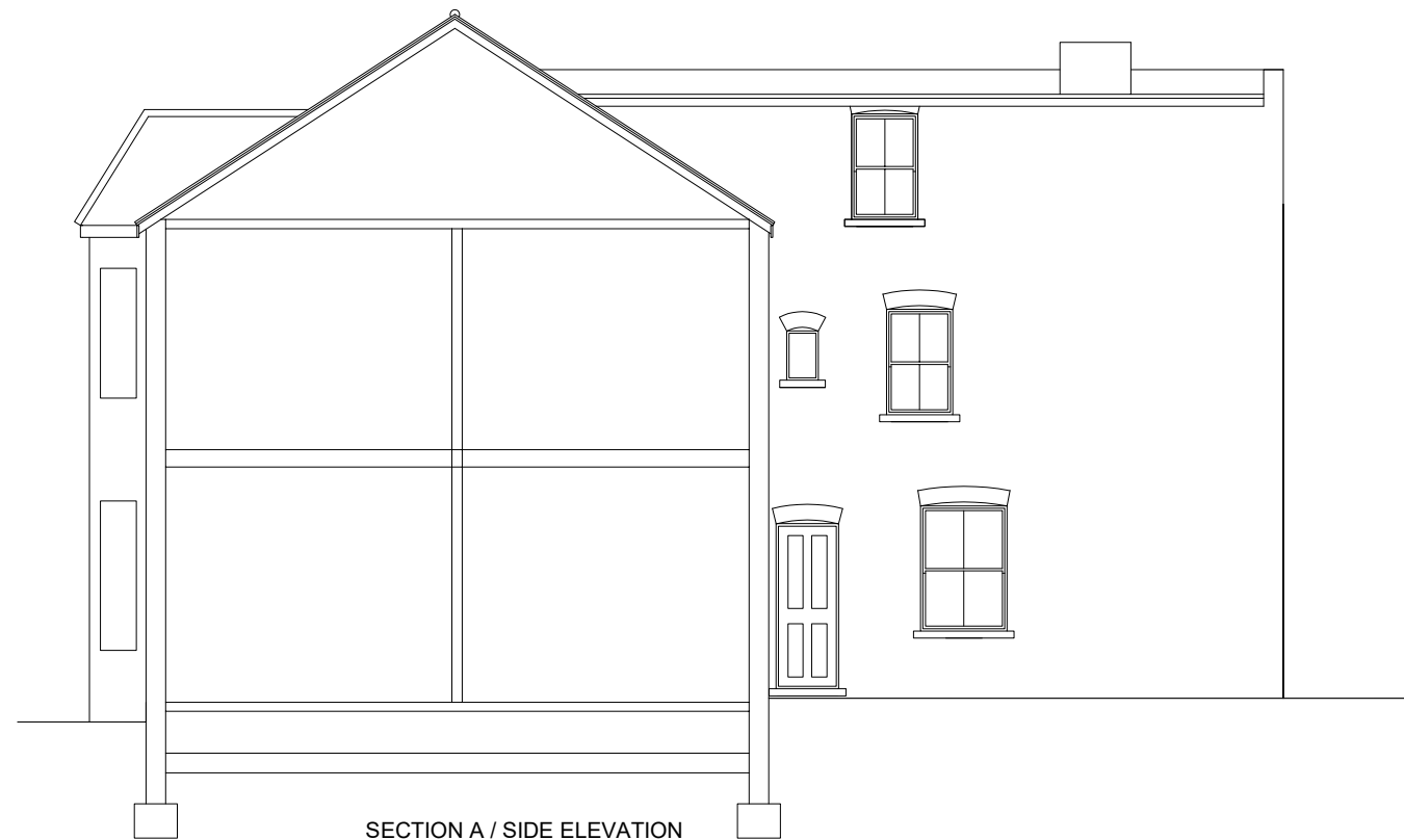
SECTION A / SIDE ELEVATION