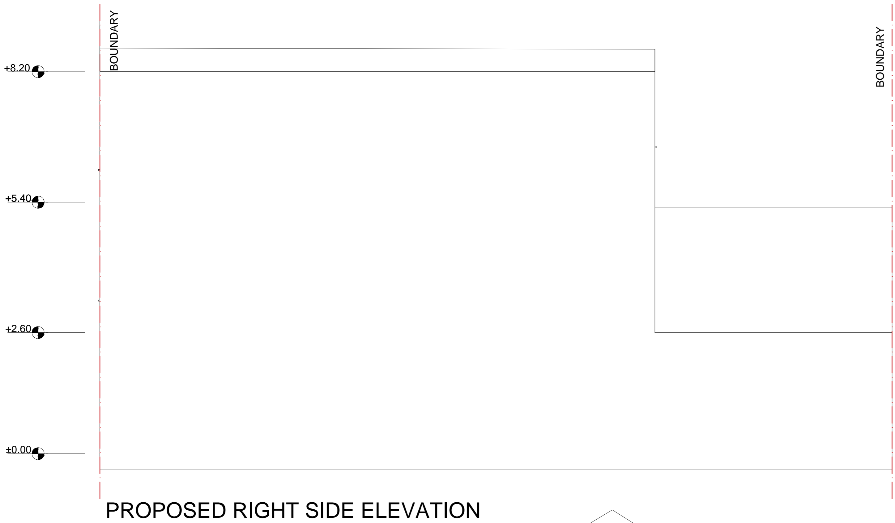
PROPOSED RIGHT SIDE ELEVATION